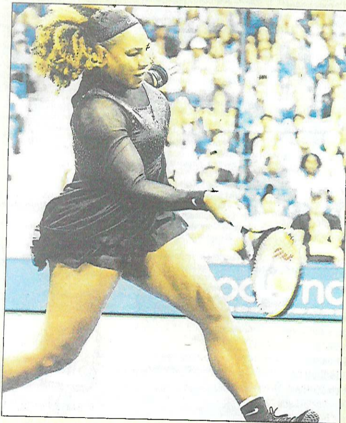
Overwhelmed... USA's Serena Williams hits a return to Estonia's Anett Kontaveit during their 2022 US Open Tennis tournament women's singles second round match at the USTA Billie Jean King National Tennis Center in New York.