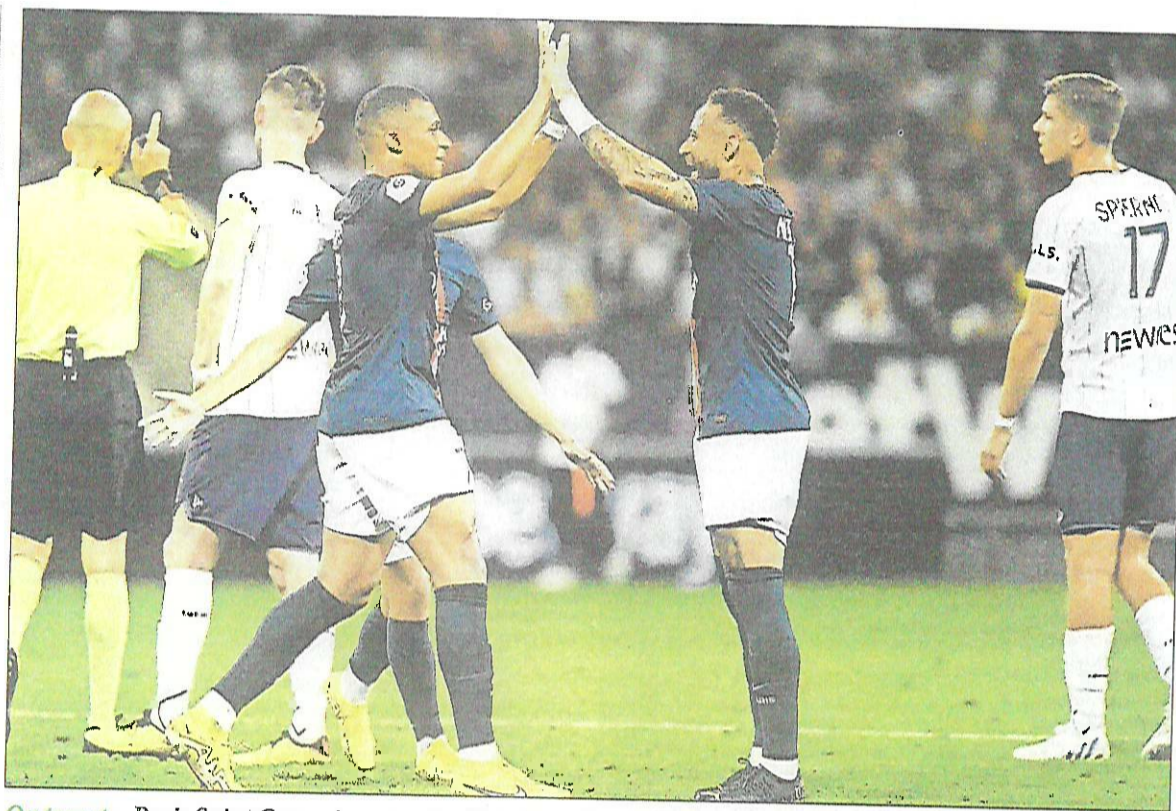
On target... Paris Saint Germain superstar Neymar achieved an enviable feat on Wednesday with his seventh goal of the season in the 3-0 win over Toulouse.

Toulouse frustrated PSG early in the game, with goalkeeper