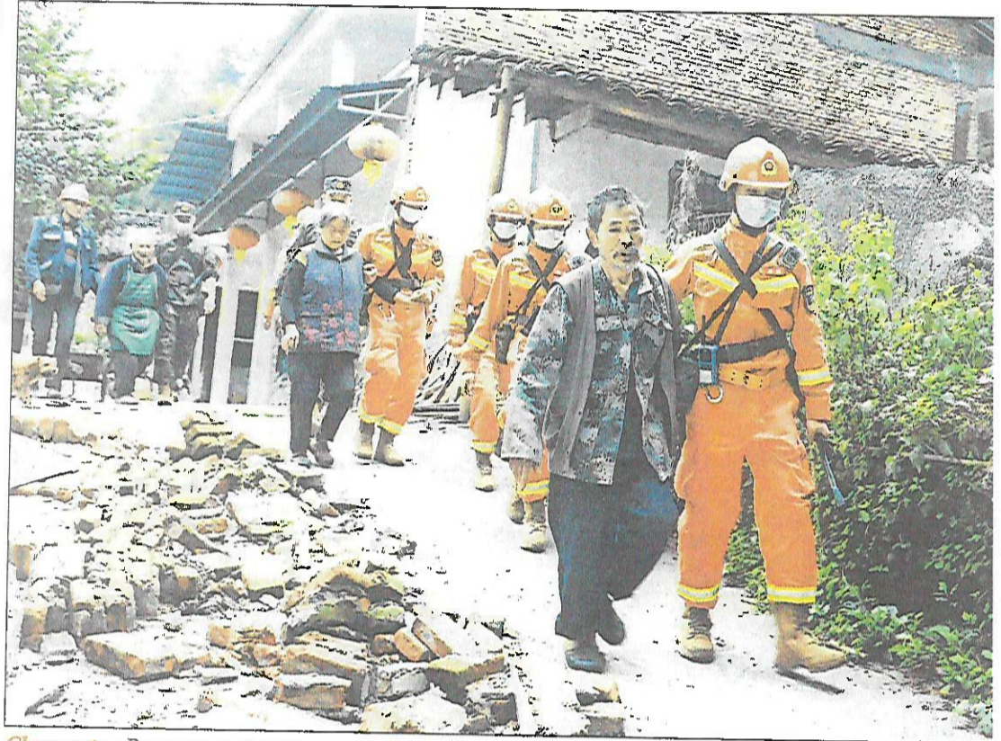
Clear out... Rescuers evacuating residents on 7 September 2022 following a 6.6-magnitude earthquake struck on 5 September in Shimian county, Ya'an city, in China's southwestern Sichuan province.

Over 22 000 people have so far been resettled into 124 temporary sites across Ganzi and Ya'an, the state-owned People's Daily