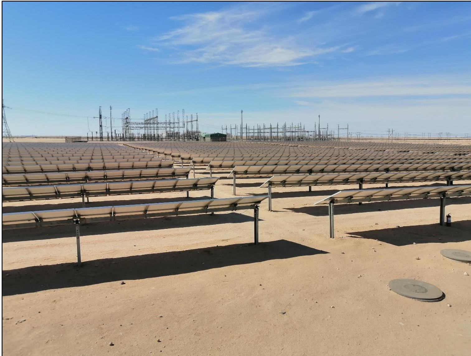
Figure 4: AREVA NamPower Substation adjacent to the Solar Park site (immediate southeast of the solar panels)