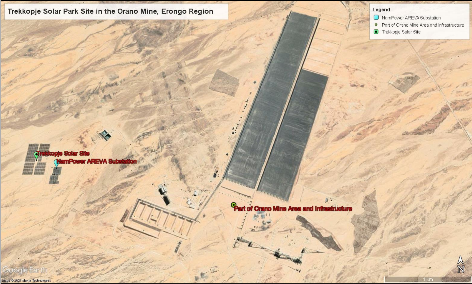
Figure 3: Close-up view of the Solar Park and NamPower Substation (B)