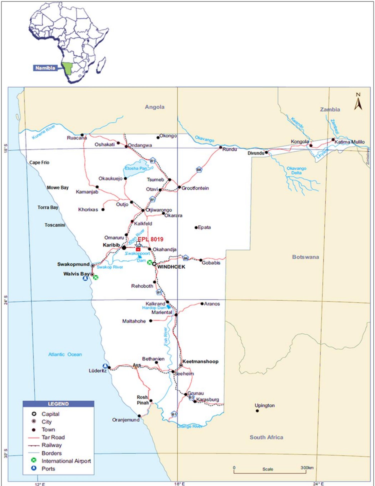
Figure 1.1: Regional location of the EPL No 8019 Area.