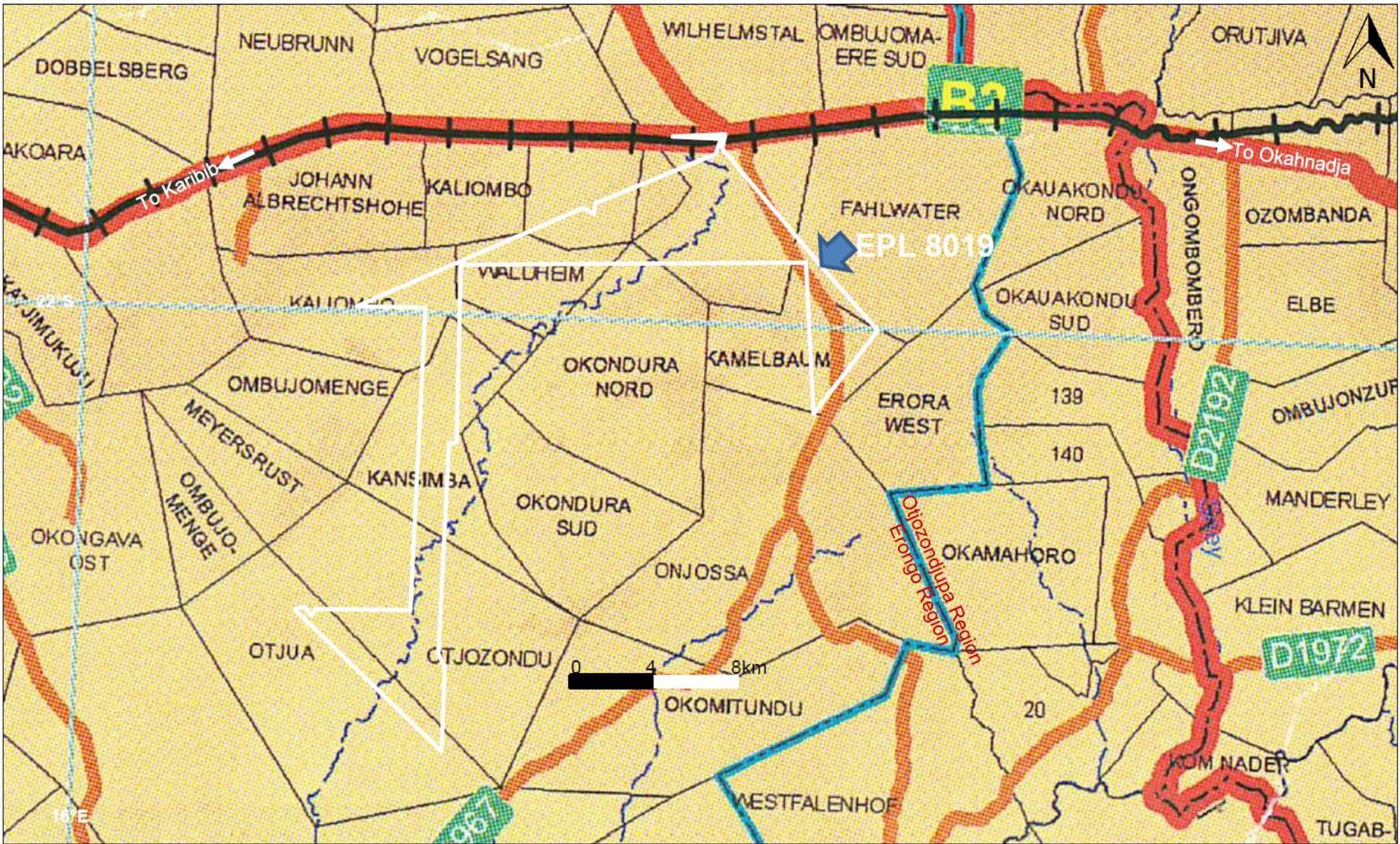
Figure 1.3: Commercial farmland covered by the EPL 8019 and existing access.