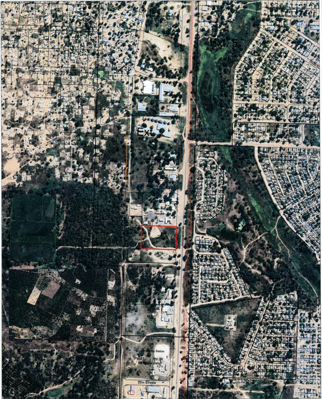
AERIAL VIEW PLAN OF THE REMAINDER OF ERF 568, KATIMA MULILO EXTENSION 2