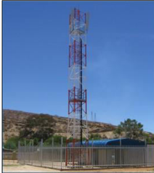
Figure 2-1: Example of the proposed tower

( https://www.powercom.na/index.php/portfolio-details/item/2-lattice#portfolio-wrapper )