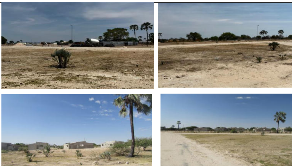
Figure 5-2: Vegetation commonly located within the subject area