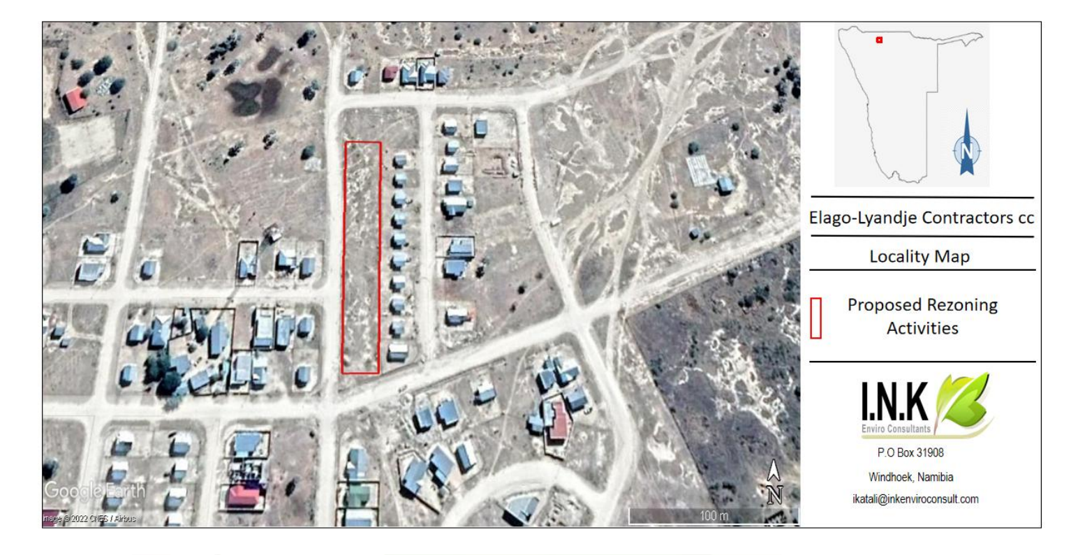
Figure 1: Locality Map

Management Plan (EMP). It is with this background that, I.N.K Enviro Consultants cc (I.N.K) an independent firm of consultants, was appointed to undertake the Environmental Impact Assessment process for this project. More details regarding the EIA process that was followed are presented in Section 1.4.1.