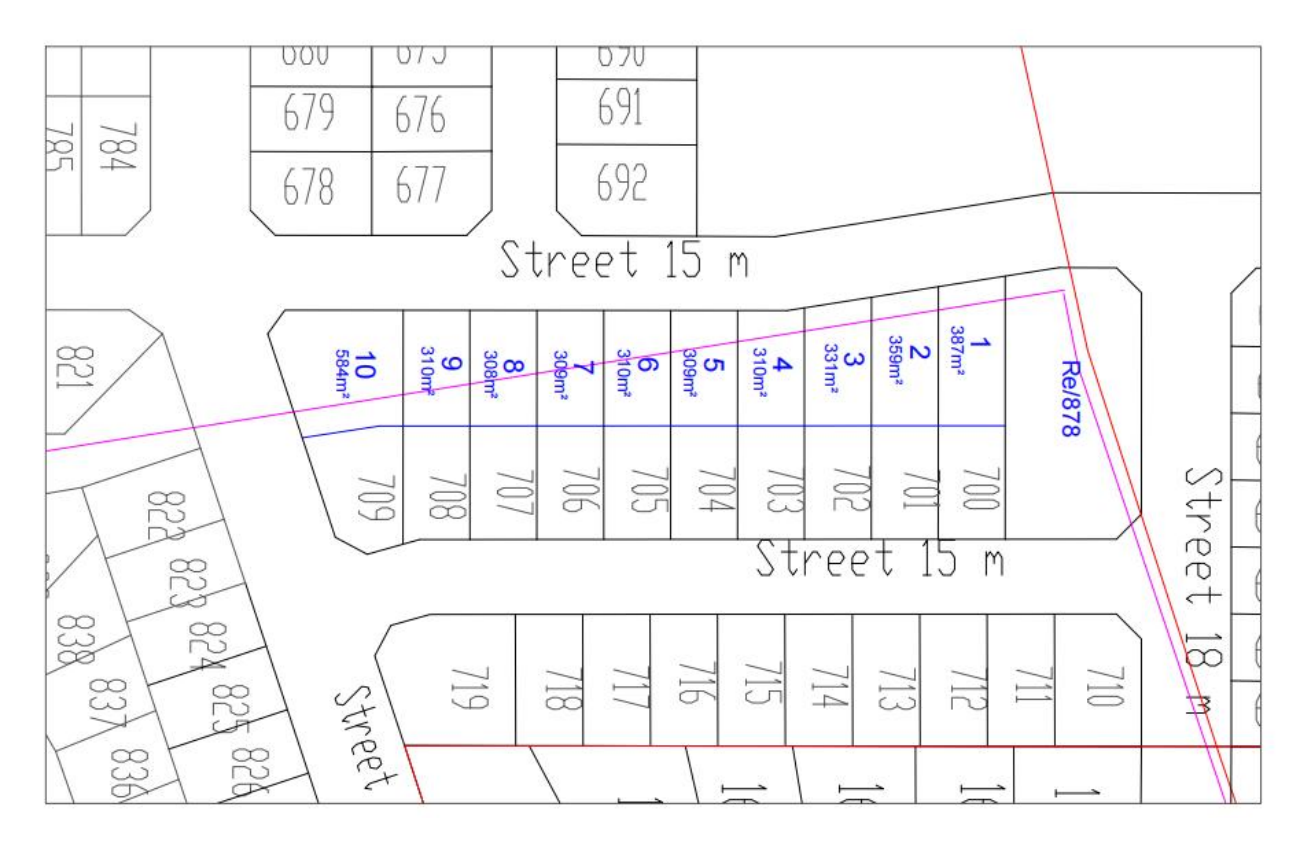
Figure 3: Proposed Subdivision

Elago-Lyandje Contractors cc (hereinafter referred to as Elago-Lyandje), intends on obtaining an Environmental Clearance Certificate (ECC) for for the rezoning of a portion of the public open space erf 878, and subdivide it into ten (10) single residential ervens measuring a total of 3517 m<sup>2</sup> (refer to Figure 3).