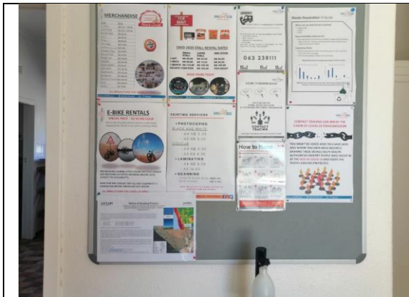
S -28,552675°, E 16,427876°