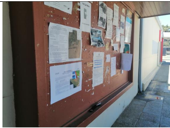
S -28,552341°, E 16,427752°