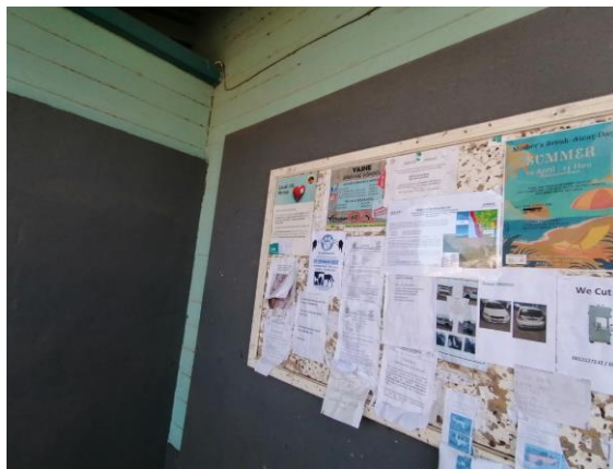
S -28,552126°, E 16,427748°