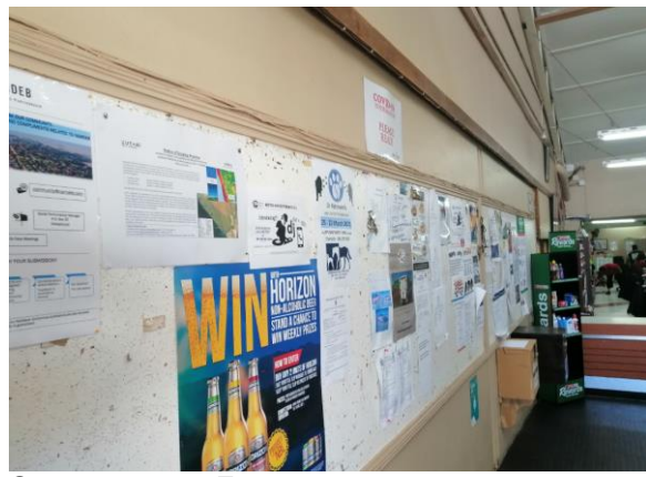
S -28,551542°, E 16,425911°