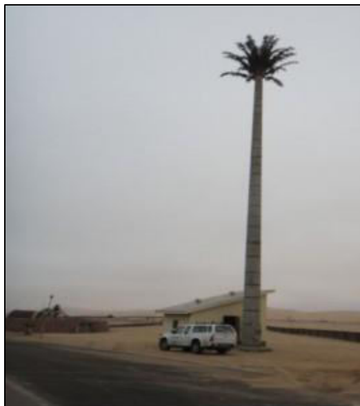
Figure 2-1: Example of the proposed tower

( https://www.powercom.na/index.php/portfolio-details/item/2-lattice#portfolio-wrapper )