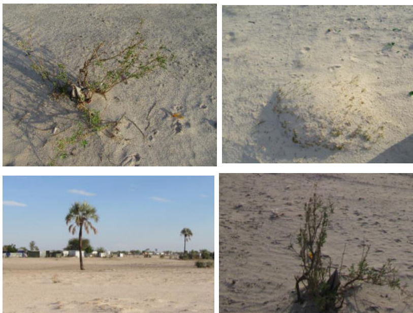
Figure 5-2: Vegetation commonly located within the subject area

The proposed development is located within the urban locality of Ondangwa. There are scattered trees located on the subject site. Figure 5-2 below depicts the vegetation commonly found within the subject area.