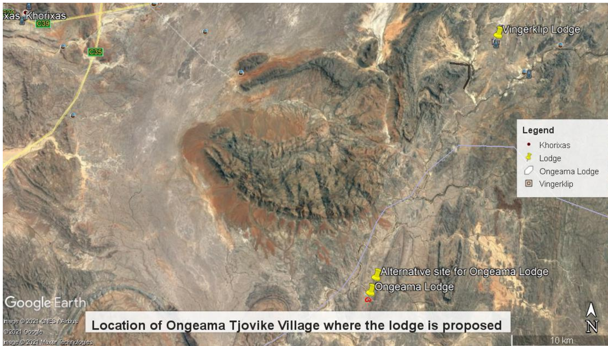
Figure 1: Location of the proposed lodge