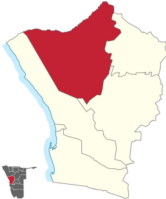
Figure 2: Daures Constituency (red) in Erongo Region (yellow)