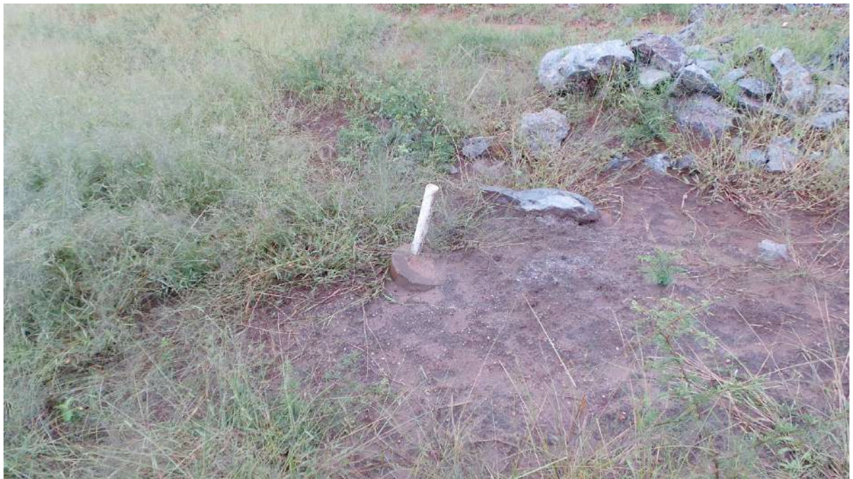
Figure 1 RC drill hole are after rehabilitation (Photo for illustration purpose)

During exploration, evasive processes includes trenching and drilling. Trenching is normally done by hand, they are not deep and they are immediately rehabilitated after sampling. Drilling may necessitate the establishment of access roads to targets site, hence these must be rehabilitated immediately. After geochemical sampling with the drill, the casing must be removed and the drill hole must be properly covered, unless otherwise agreed with the locals to leave the casing for purpose of making water borehole (Figure 1).