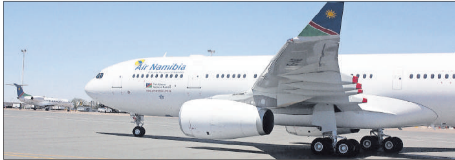
SO LONG: An Airbus 330 aircraft that formed part of Air Namibia's fleet.

Jooste dispelled any fears government would face legal action, saying discussions had been ongoing for some time now.