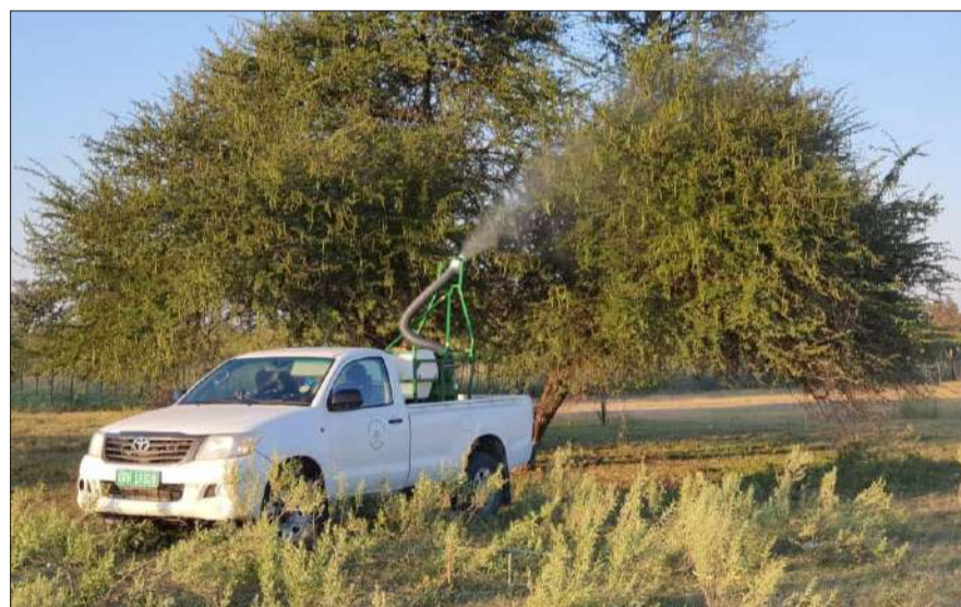
Gone with the wind... Agriculture officials spraying locusts in Ohangwena.

Agriculture spokesperson Jona Musheko shared similar sentiments that destruction was relatively low but