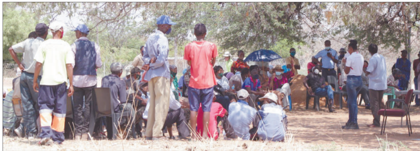
Topical... A scene from last year's meeting held at Tsintsabis to address the land issue.