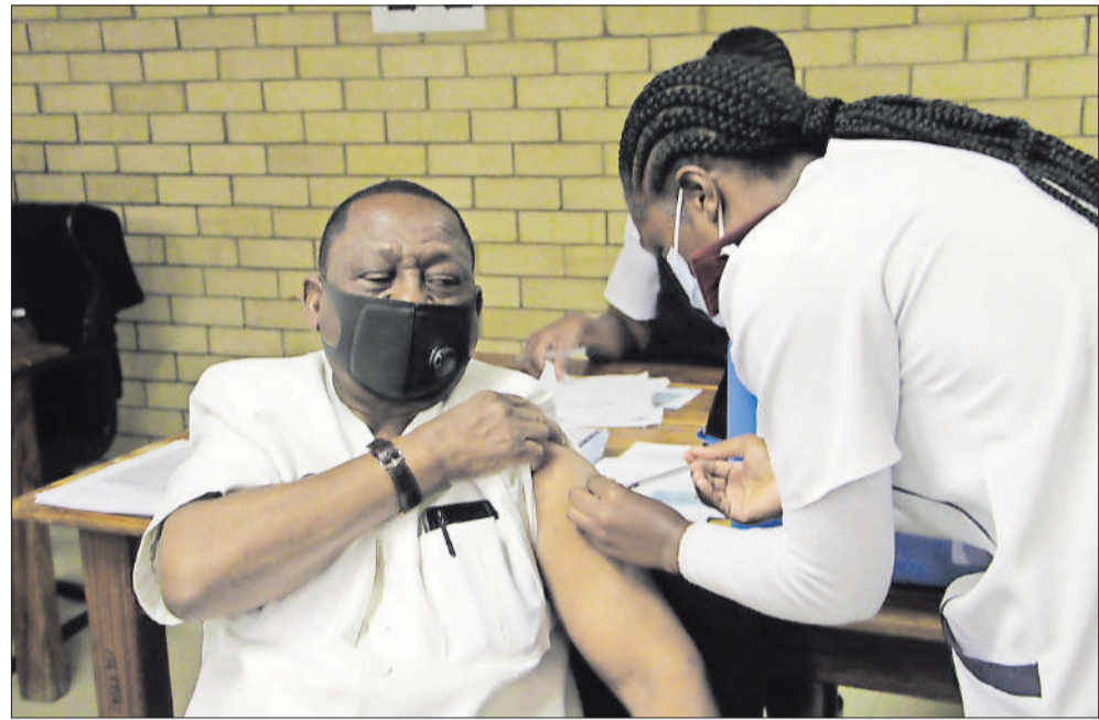
GET THE SHOT: Health minister Dr Kalumbi Shangula getting vaccinated for Covid-19.

To date, 47 776 Namibians have been infected by Cov-