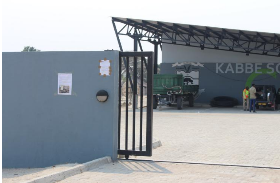
Figure 12: Site Notice- Kabbe south constituency office

A site notice was placed at Nakabolelwa combined school and the kabbe south constituency office. These provided information about the project and related EA while providing contact details of the project team.