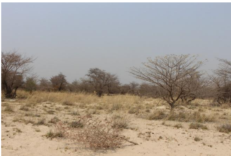
Figure 8: Overview of vegetation on site

However, the project site is dominated by Tristachya nodiglumis (grass species), surrounded by Terminalia sericea growing in sandy soil. Therefore, the project site will not have an effect on the flora due to the site area size. The removal of any vegetation surrounding the site area should still be done in a properly managed, planned and responsible manner to avoid the destruction of unnecessary ground cover. The rehabilitation of disturbed areas is important and should be done following the Environmental Management Plan (EMP) hence the project will have minimal impacts on the environment.