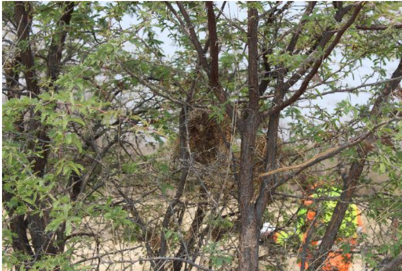
Figure 6: Habitat-Bird Nests