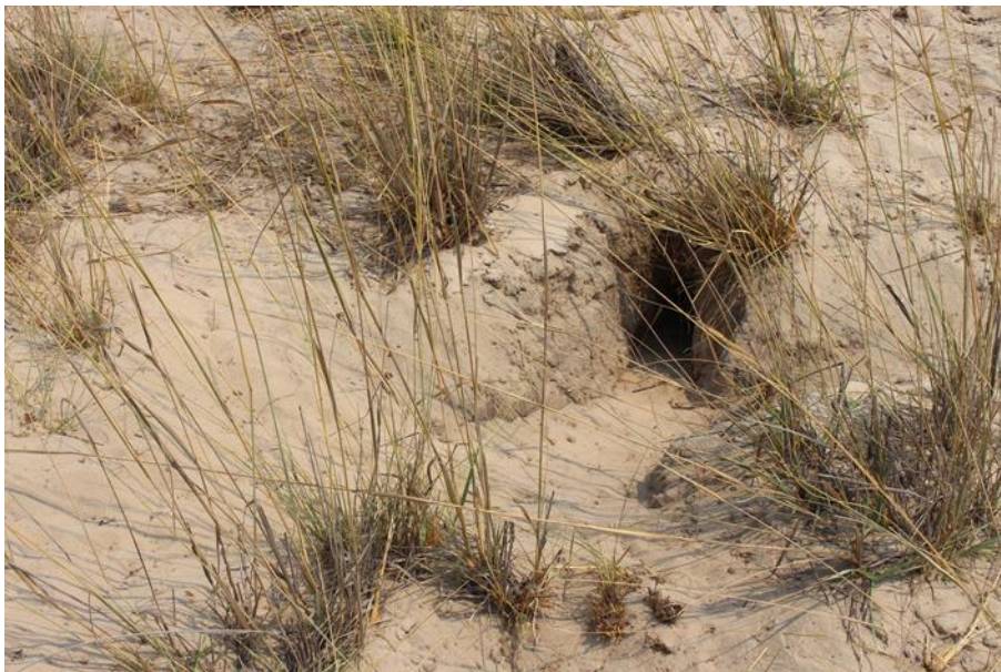
Figure 5: Habitat-Spring Hare

Even though there were no animals observed on-site or surrounding area, there were habitats of ground-dwelling species of spring hare observed close to the site and bird nests observed on acacia trees. And since there are no boundaries between surrounding areas, wild animals roam freely and may be observed in this area from time to time due to human presence. Therefore, the project will not affect the fauna, due to the site area being dominated by grass species and due to the project area size. But the habitat of ground-dwelling species should be avoided or contact such as trampling should be minimised to reduce habitat destruction.