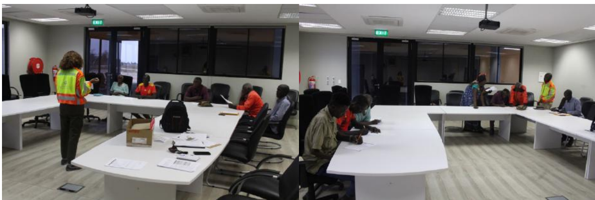
Figure 14: Community engagement meeting conducted

A public meeting was scheduled on Wednesday, 19 September 2022 at kabbe south constituency office, Zambezi region, and the meeting was well attended by stakeholders. Appendix b has a detailed list of the attendance register. The consultant administered questionnaires during the meeting to all members who attended the meeting.