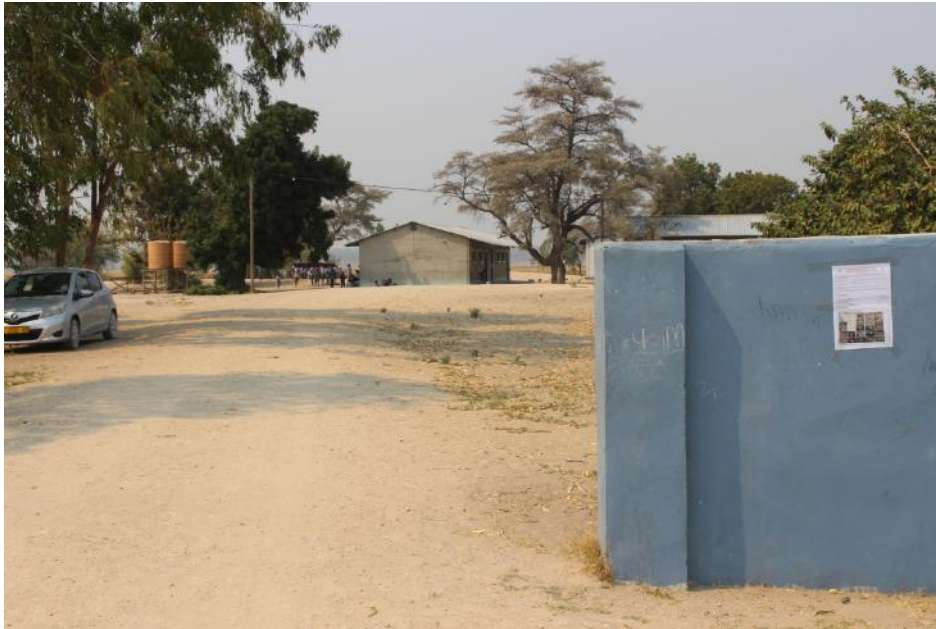
Figure 13: Site notice- Nakabolelwa combined school