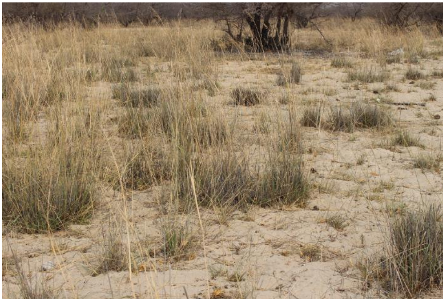
Figure 10: Tristachya nodiglumis