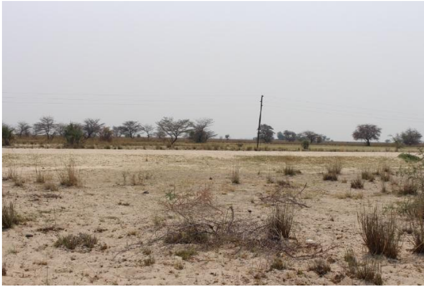
Figure 3: Infrascructe- Powerline and Main Road close to the site