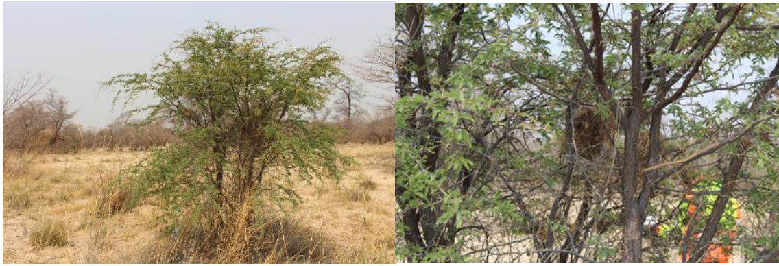
Figure 7: Bird nest on Acacia tree