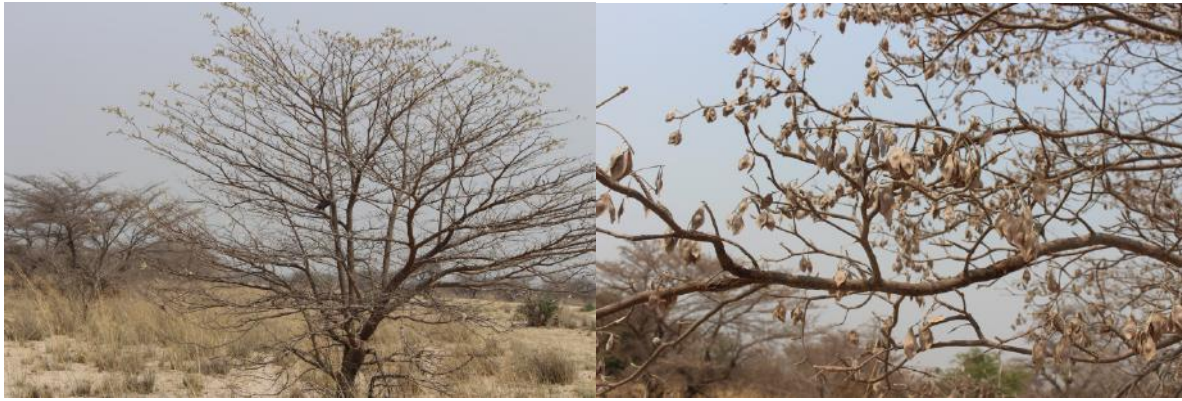
Figure 9: Terminalia sericea