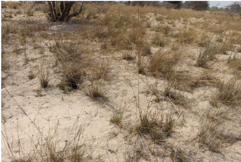
Figure 11: Soil type-Sandy soil

minimised to prevent wind erosion. The footprint of the construction area must be kept as small as possible and existing access roads are to be utilised at all times to avoid off-road tracks. The project footprint area should not be cleared entirely and the site should be rehabilitated after the construction phase.