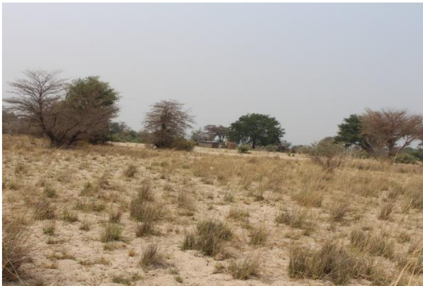
Figure 4: Land use- Household (about 217m from site)

The economic center of Nakabolelwa area is about 3km from the site that consists of the Nakabolelwa combined school, homesteads, church, and the kabbe south constituency office. The general land use surrounding the project area includes small-scale agriculture or subsistence farming and conservancy. Land use consists of communal land that focuses on cattle and crop farming. The trees in the area are used for fuel and building houses or sold. The grasses especially from the water channels are used as thatch for houses or sold. Other resources are used for food and medicine. The Chobe river, Lombe, or Miyaze water channel provide water, fish, and thatch. Other economic activity includes tourism as Nakabolelwa village is in Ngoma, which is part of the Salambala Conservancy. Therefore, the proposed tower will have a positive impact on economic activity as it will improve network connections for businesses or boost tourism in the area. The Nakabolelwa residents will also have internet access to communicate with associates, family, and friends.