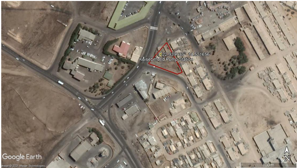
Figure 1. New sewage pump station in Kuisebmond with coordinates -22.939733° 14.521656°