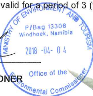
Teofilus Nghitila ENVIRONMENTAL COMMISSIONER