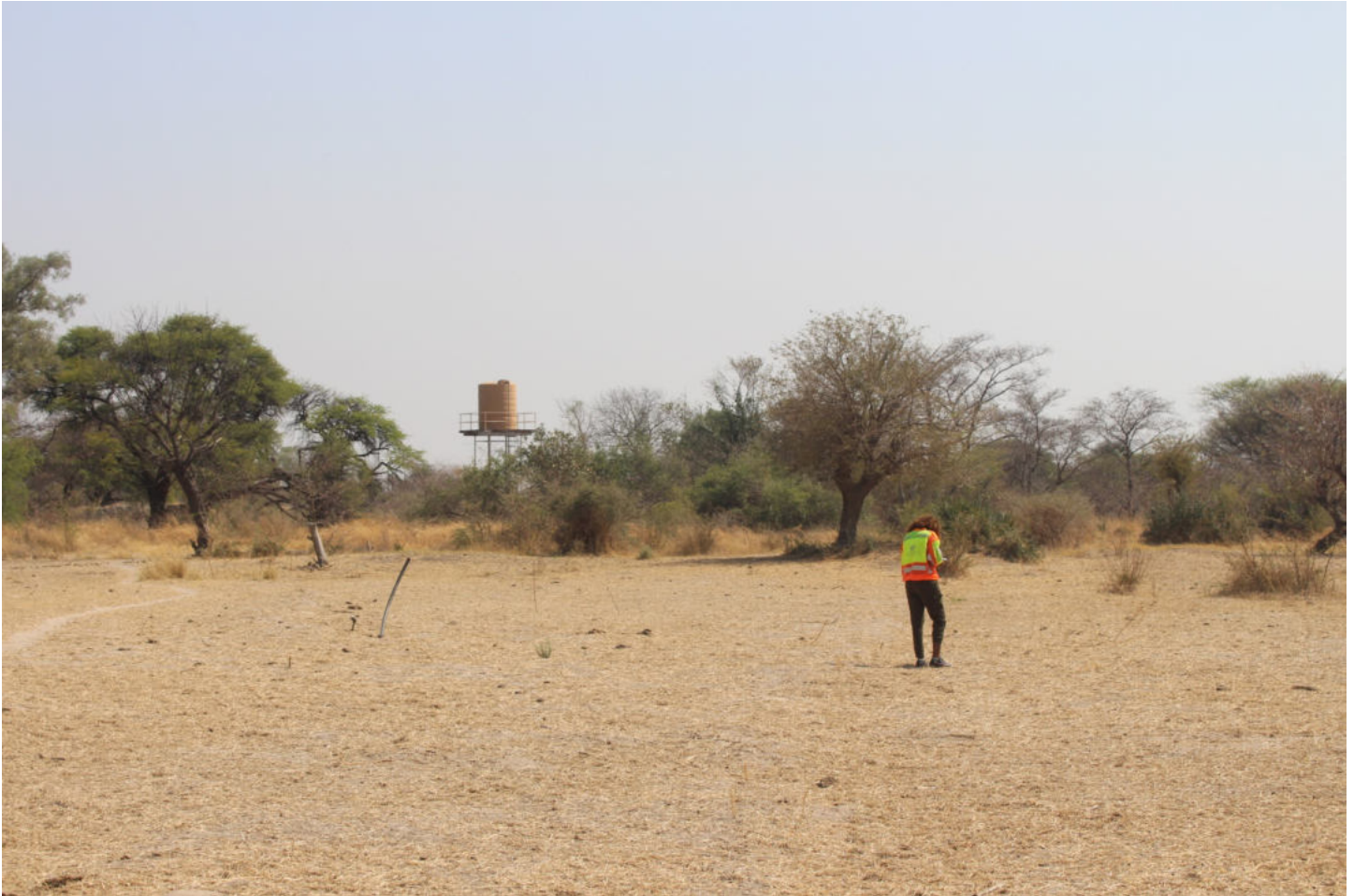
Figure 2: Description of the project site