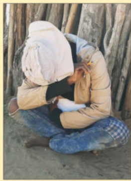
Vati ta li ovanhu... Omukainhu ta ningilwa omatilifo edipao shaashi vati ta li ovanhu momukunda.

Oshiwana osha ninga omunyano oshivikeshadja ko peumbolomukainhu