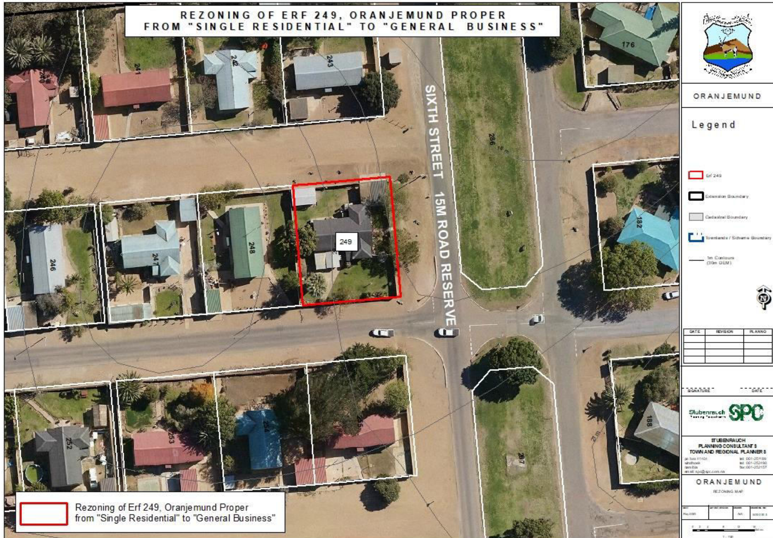
Figure 2-3: Aerial Map of Erf 249, Oranjemund Proper