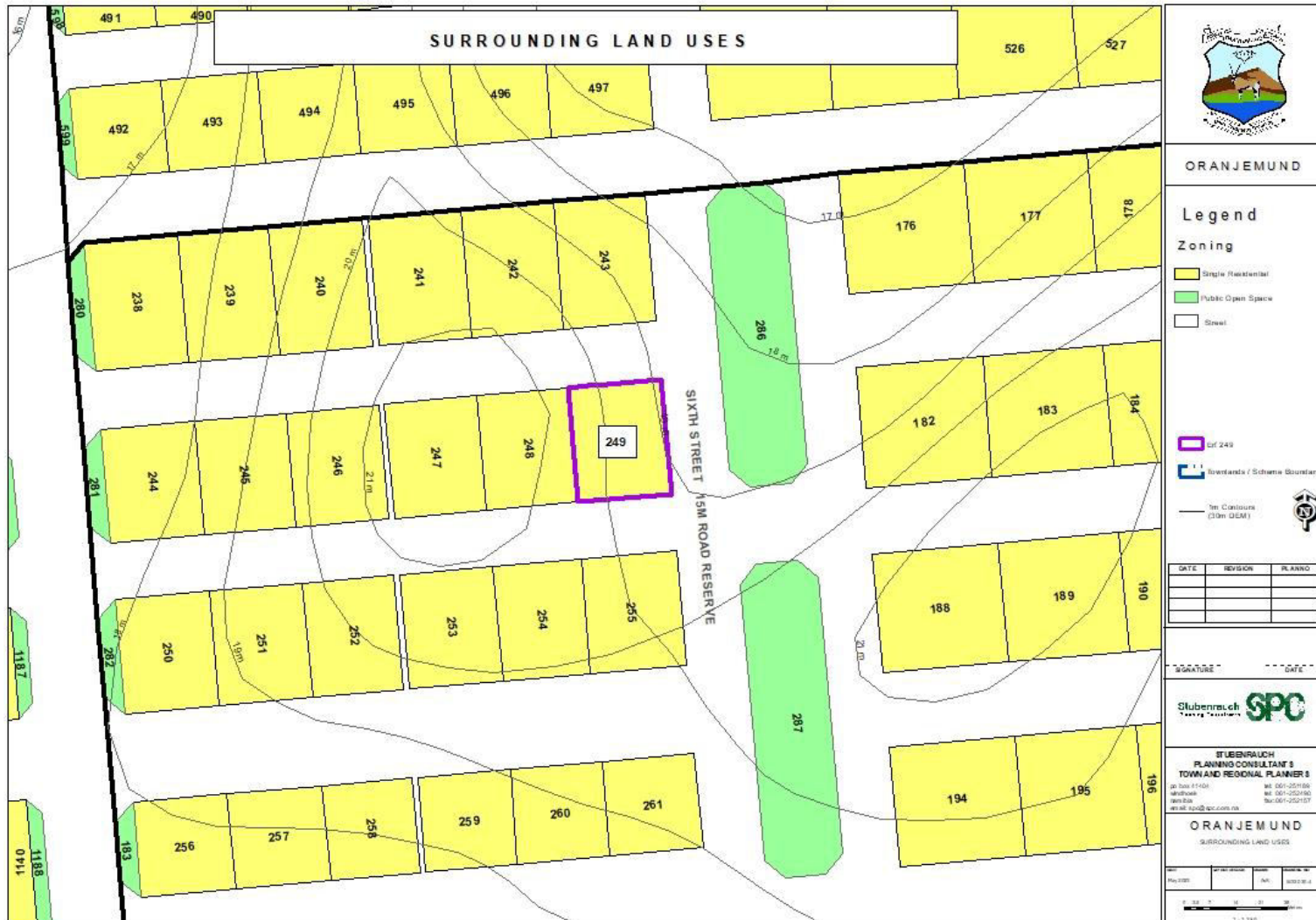
Figure 2-4: Erf 249, Oranjemund Proper Surrounding Land Uses