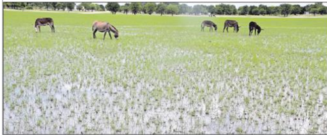
Most of Namibia received good rains, which resulted in a significant drop in sales of licks and feed at Agra in the six months ended 31 January 2021.