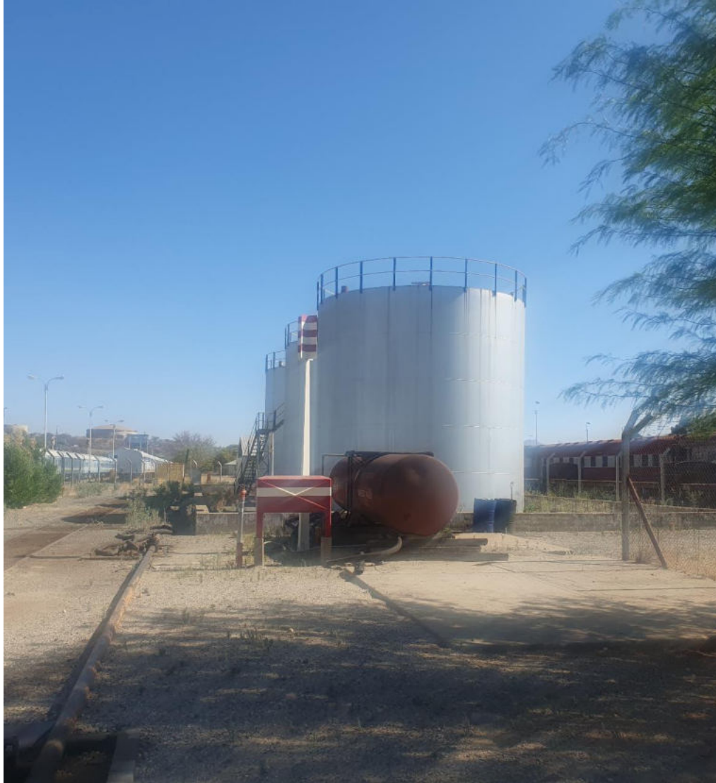
Figure 1: 50 000L Above Ground tanks