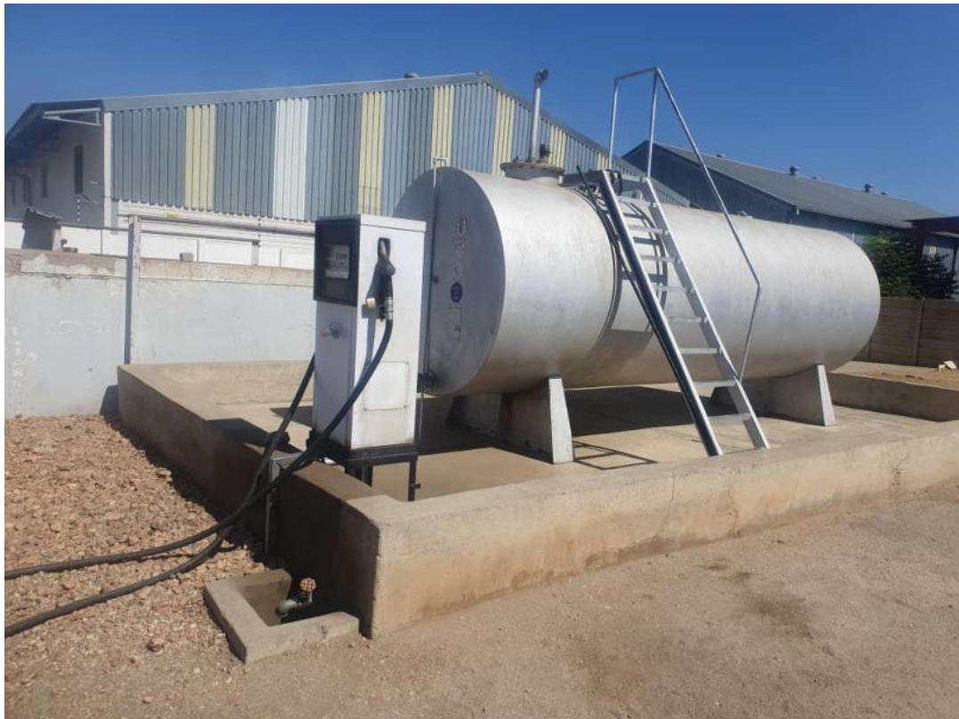
Figure 1: Above Ground Engen 23 000L tank

The existing Engen installations have a valid Petroleum Consumer License approved by the Ministry of Mines and Energy. The site operations and installation are in accordance with Engen Namibia (Pty) Ltd policies and regulations. Diesel is stored in a 23 000L capacity above ground tank see Figure 1 below.