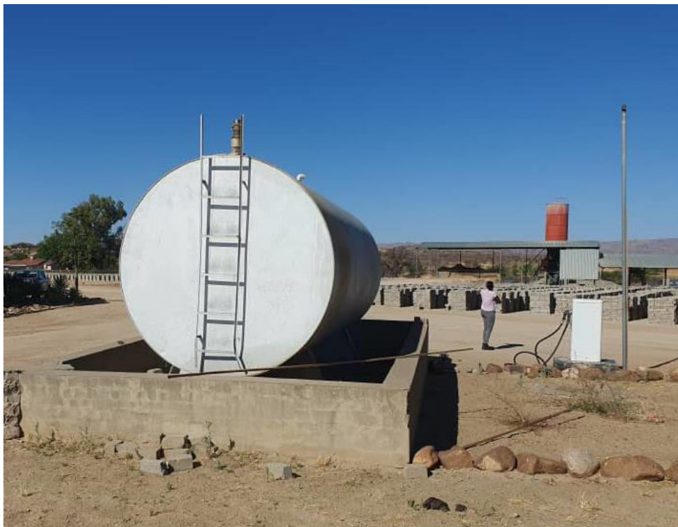
Figure 1: Above Ground Engen 23 000L tank

The existing Engen installations have a valid Petroleum Consumer License approved by the Ministry of Mines and Energy. The site operations and installation are in accordance with Engen Namibia (Pty) Ltd policies and regulations. Diesel is stored in a 23 000L capacity above ground tank see Figure 1 below.