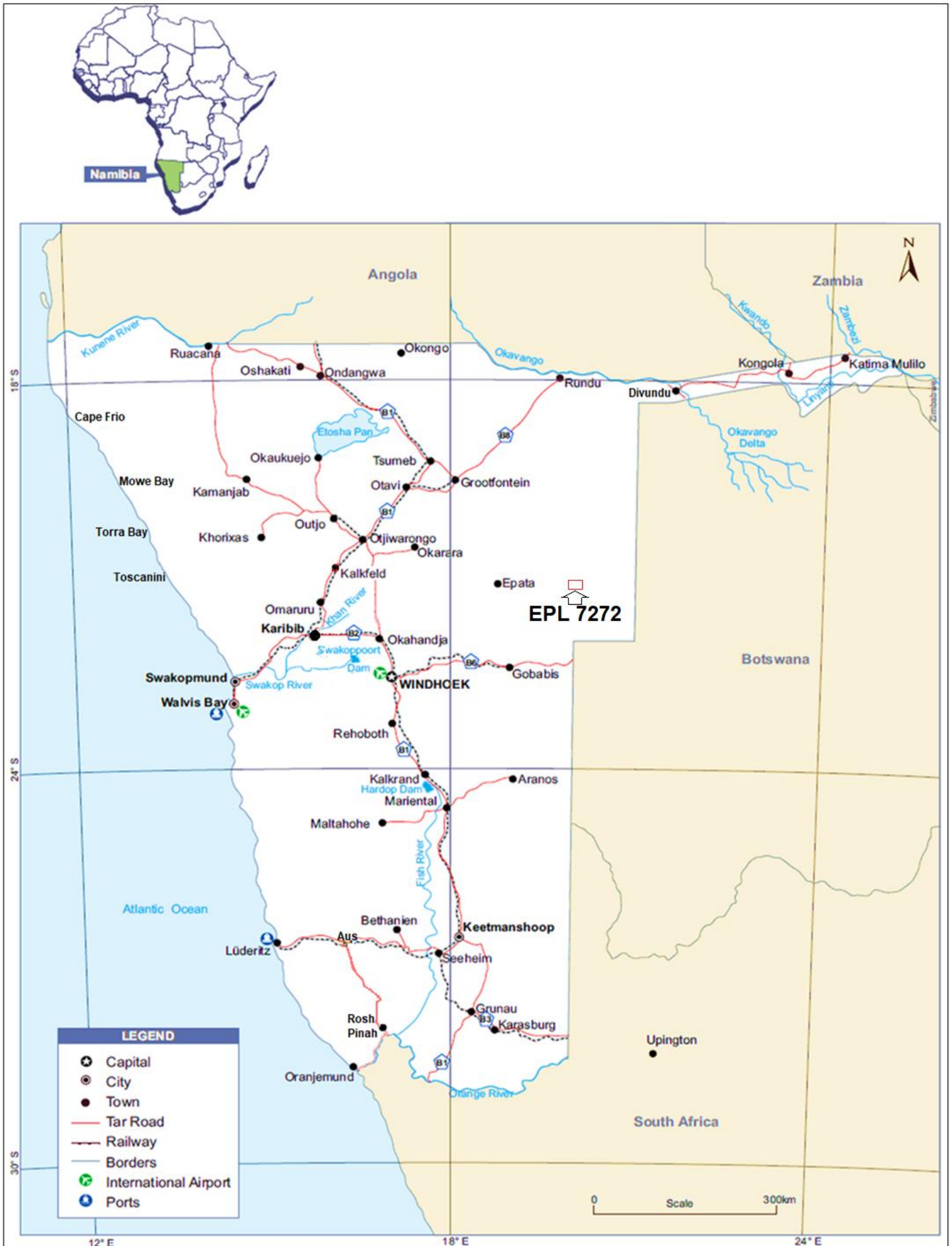
Figure 1.1: Regional location of the EPL No 7272 Area.