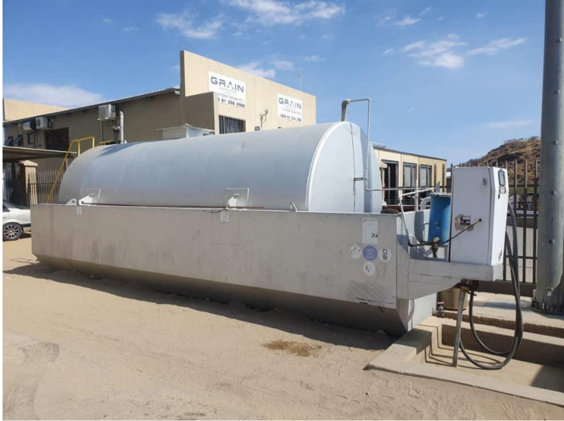
Figure 1: Above Ground Engen 23 000L tank