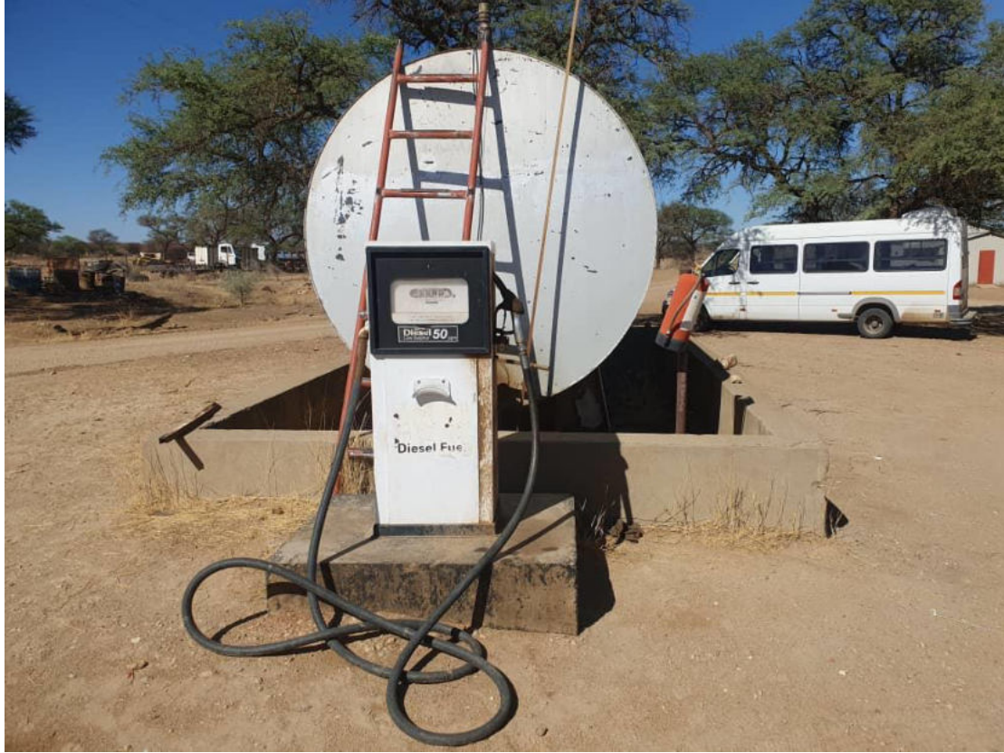
Figure 1: Above Ground Engen 23 000L tank