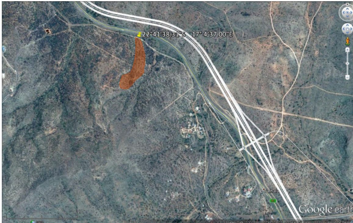
Figure 1: No-go area on Farm Regenstein.