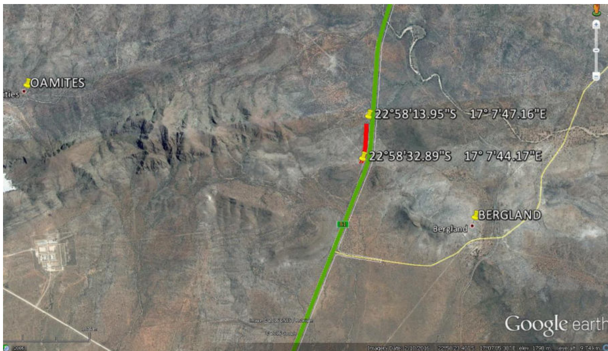
Figure 2: Sensitive stretch near Bergland/Oamites.