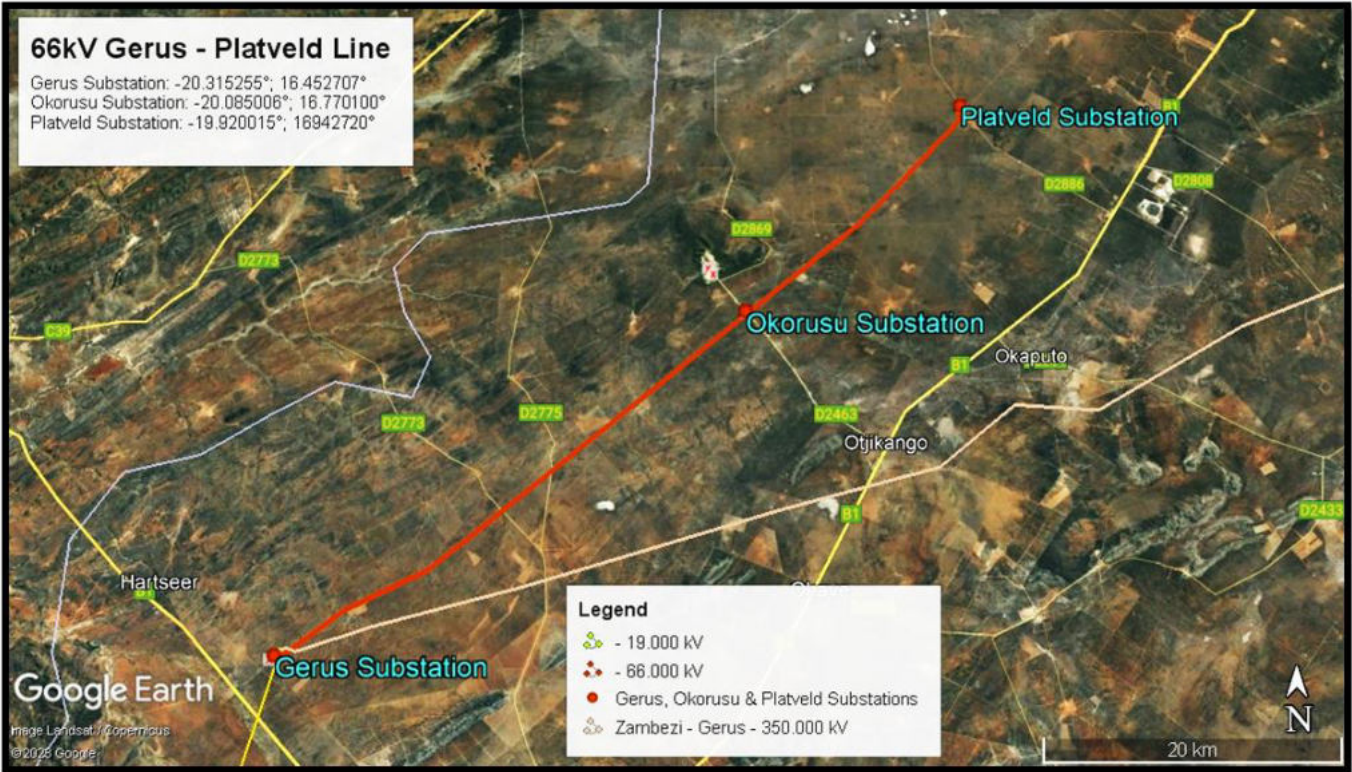
Figure 1: Locality map showing the 66 kV Gerus- Platveld transmission line

The 66kV Gerus-Platveld is 68.7km in length and was constructed in 1996 with wooden H-Pole structures. This powerline runs from Gerus substation to Platveld substation. This powerline runs from Gerus substation to Platveld Substation station. The Okorusu and Platvled substations cover footprints of about 2351 and 2330 sqm. Figure 1 below shows the locality map for this transmission line.