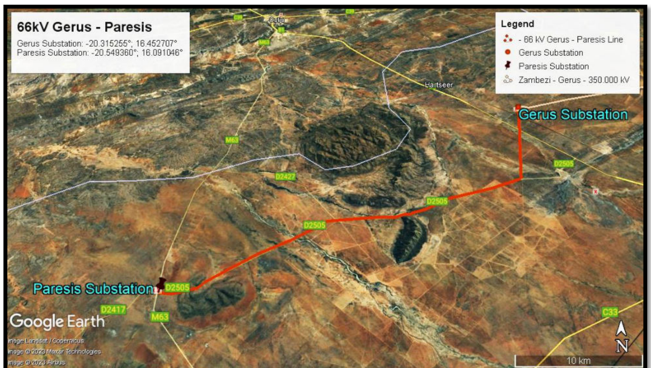
Figure 1: Locality map showing the 66 kV Gerus- Paresis transmission line

The 66kV Gerus-Paresis is 38.2km in length and was constructed in 1999 with wooden Kamerad structures. This powerline runs from Gerus substation to Paresis Substation. The Paresis substation cover a footprint of about 2314 sqm. Figure 1 below shows the locality map for this transmission line.