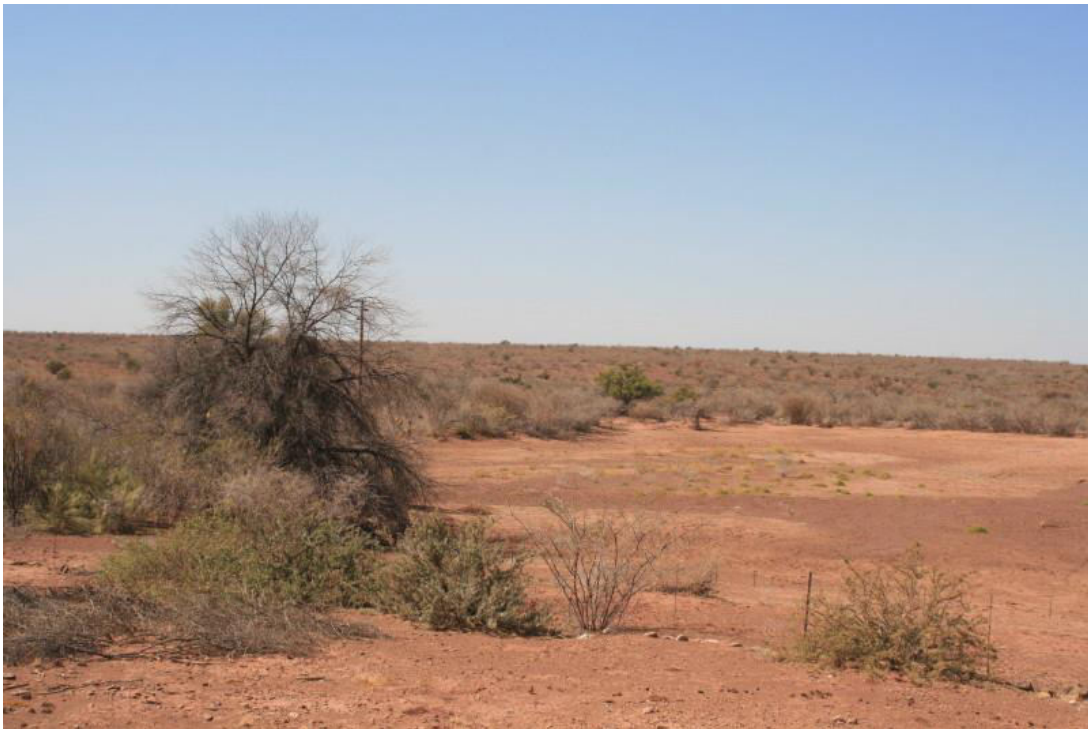
Figure 4. Borrow pit areas along the entire route now serve as “artificial pans” and viewed as sensitive habitats (“high”).

The impact of common line and substation activities such as inspections and general maintenance activities would be site specific and have a relatively small environmental “footprint” and is not expected to have a major impact on the environment. In addition the