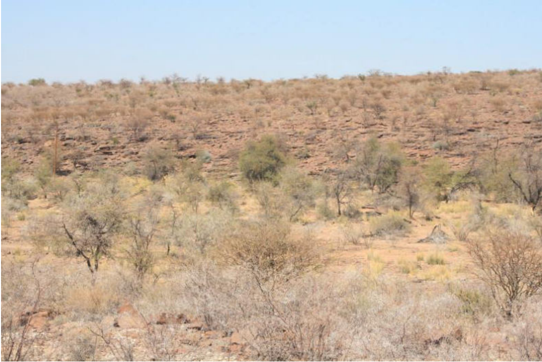
Figure 3. Ephemeral drainage line alongside a rocky ridge is viewed as sensitive habitats (“high”).