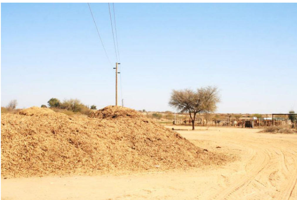
Figure 2. Dairy farm along the route viewed as sensitive habitat (“high”).

The route passes through 20 “hotspot” areas with 6 and 14 areas classified as “high” and “medium” sensitivity, respectively (See Annexure 1). The areas of “high” sensitivity are viewed as the Fish River; various larger ephemeral drainage lines; farms; borrow pits; ground dams (i.e. areas with high biodiversity or human habitation). The 11.1% of the total route is viewed as “high and medium” sensitivity and 88.9% is viewed as “low” sensitivity) with the Fish River, drainage lines and borrow pit habitats, especially areas with permanent and or seasonal water, being the most important features.