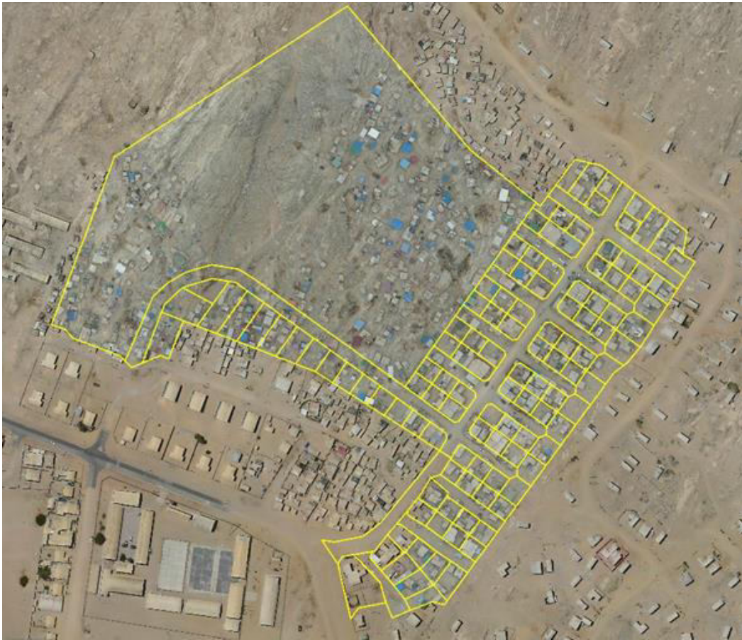
Figure 3: Aerial Layout of Benguela Extension 6