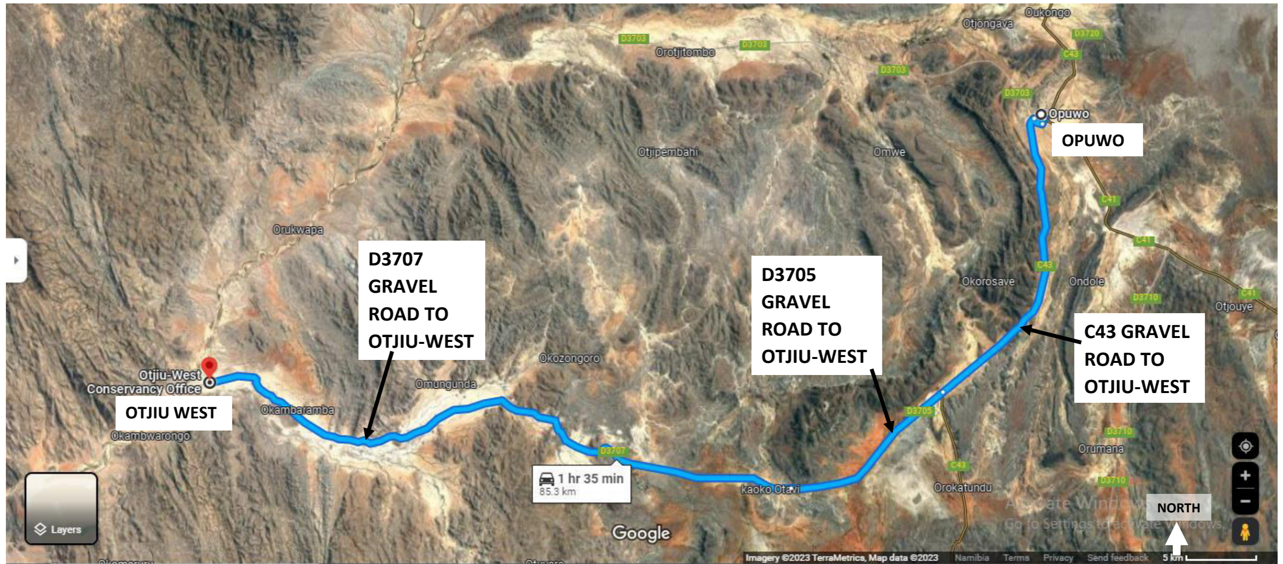
Otjiu-West in relation to Opuwo