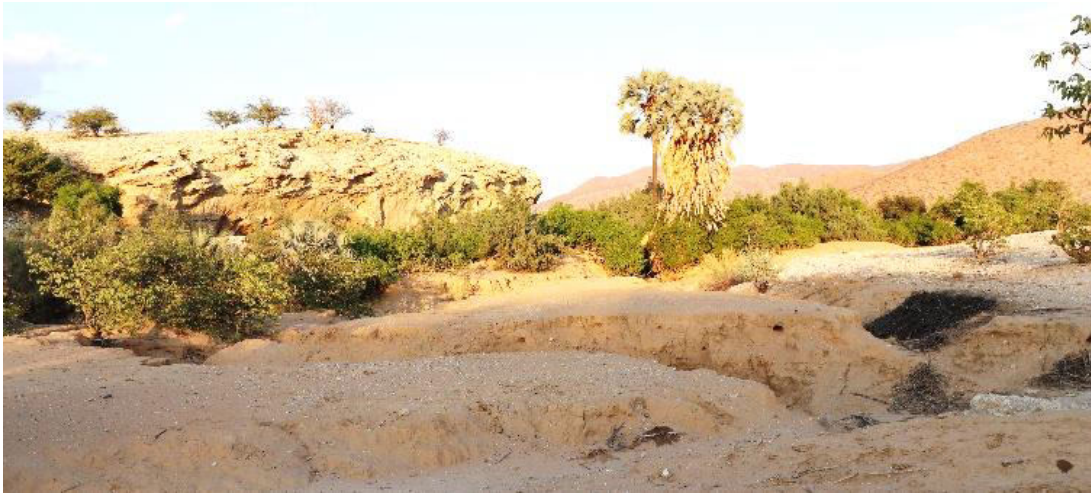
Entrance to site with soil erosion along Otjiu River. Limestone outcropping top left & makalani palm centre.

seasonally and depending on rainfall, there is movement of game and corresponding predator movement, but the extent of this could not be verified.