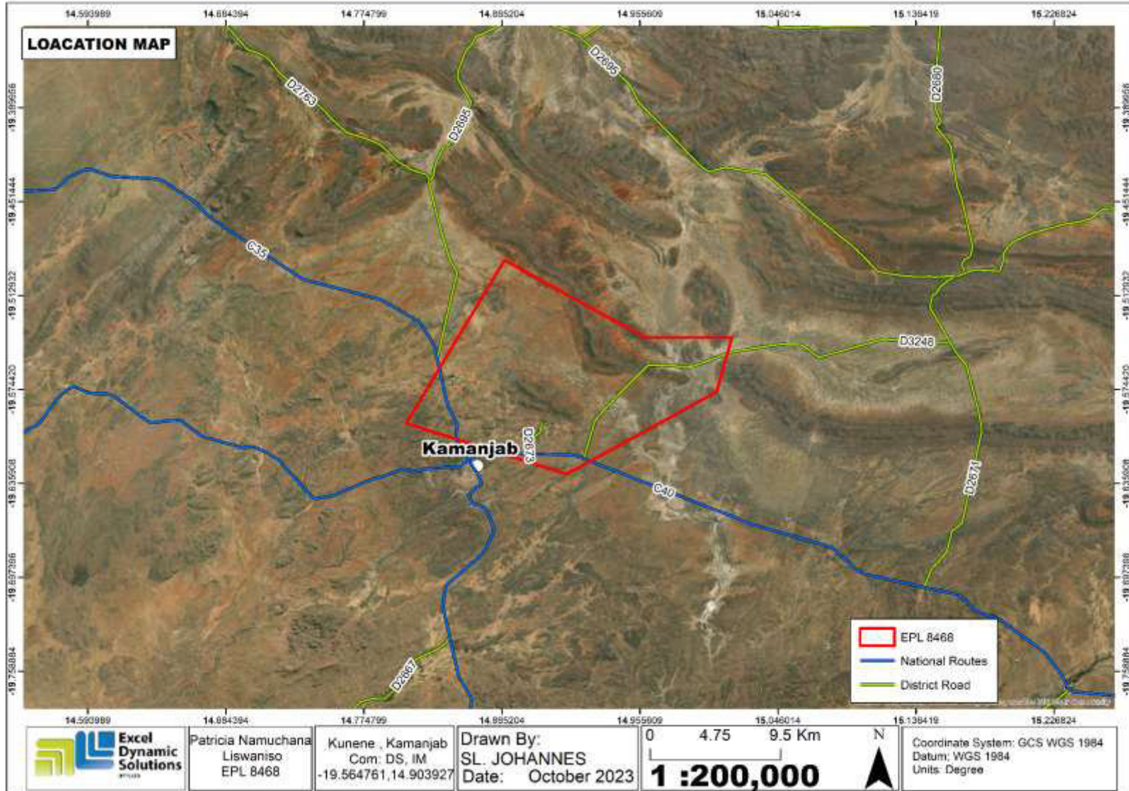
Figure 1: Location of EPL 8468