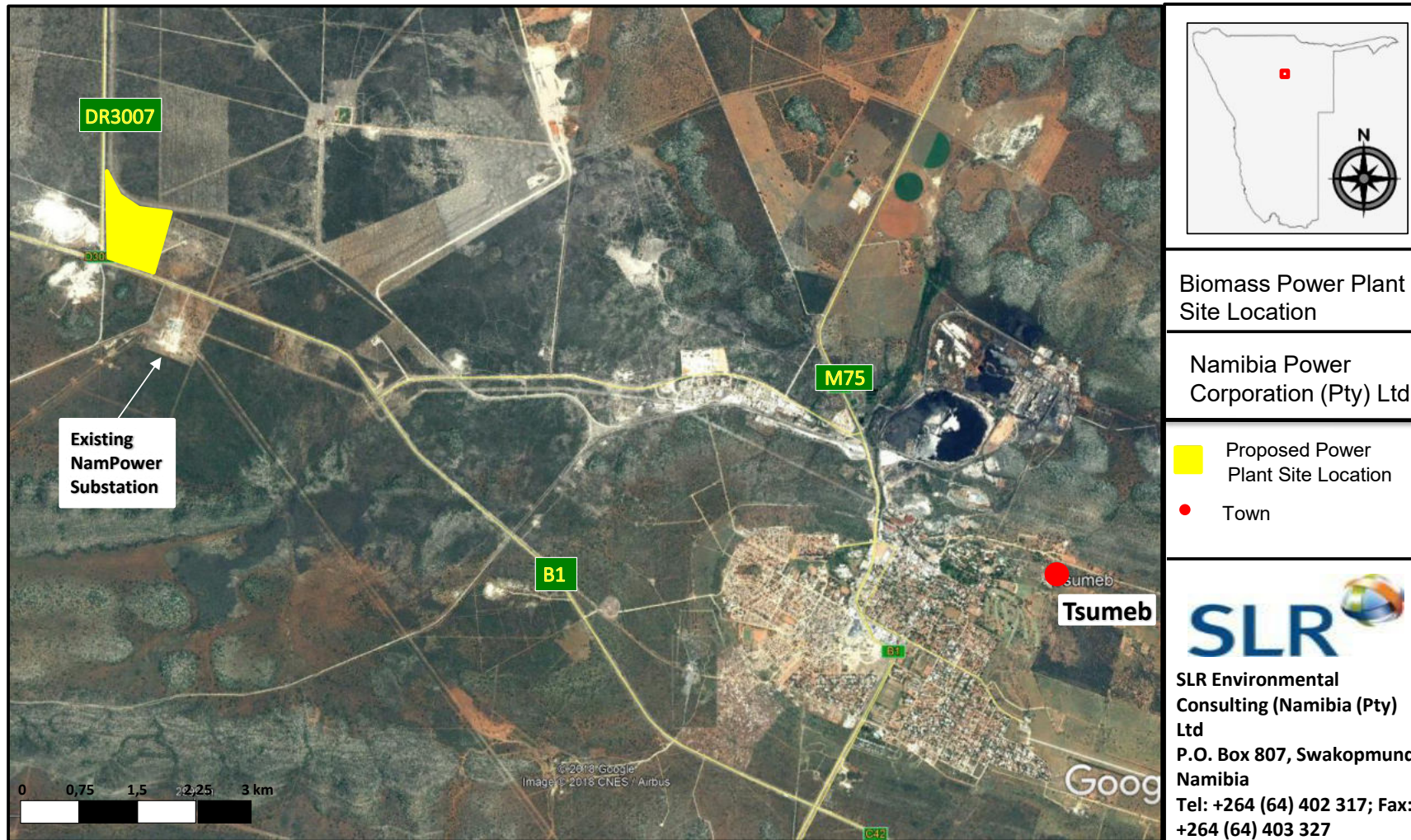
FIGURE 4-1: LOCALITY MAP FOR THE PROPOSED OTJIKOTO BIOMASS POWER STATION SITE