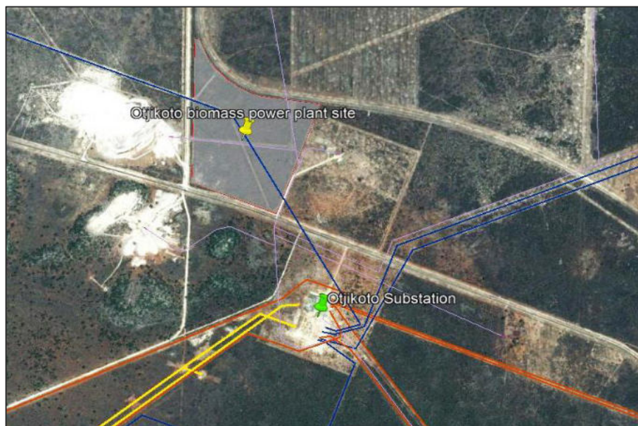
FIGURE 4-3: PROPOSED OTJIKOTO BIOMASS POWER STATION SITE AND EXISTING POWERLINES IN THE AREA.

Currently, in this phase of the project, it is planned to be re-routed to the north and east of the plant site, and will then run parallel to the new transmission line (refer to Figure 4-3), rerouting it closer to the southern boundary is also being considered.