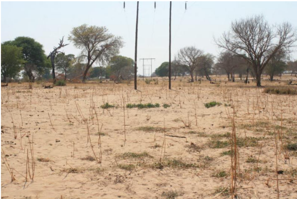
Figure 4. Active field within the transmission line servitude.

The impact of common line and substation activities such as inspections and general maintenance activities would be site specific and have a relatively small environmental “footprint” and is not expected to have a major impact on the environment. In addition the effects of the debushing activities to clear the access route for the line will have environmental effects that are within the NamPower servitude and are contained and limited.