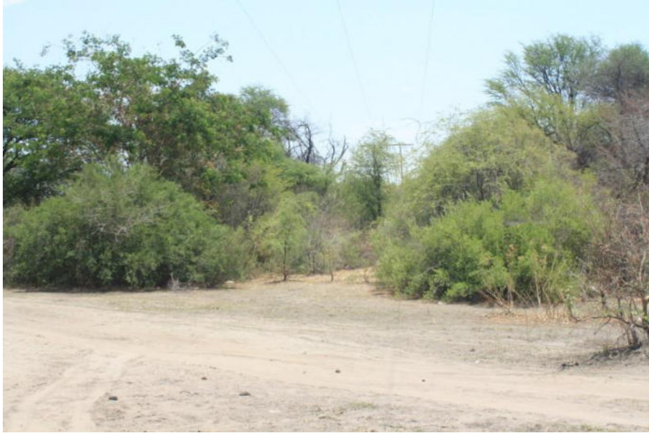
Figure 3. A densely vegetated omuramba viewed as “high” sensitive area.