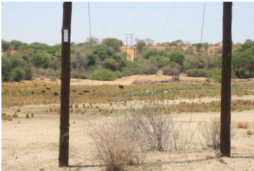
Figure 2. An open Omuramba area are viewed as “high” sensitive areas.

Protected tree species found along the line are: Vachellia erioloba , Burkea africana , Boscia albitrunca , Baikiaea plurijuga , Dialium engleranum , Guibourtia coleosperma , Hyphaene petersiana , Pterocarpus angolensis , Schinziophyton rautanenii and Strychnos spp. [ S. cocculoides , S. pungens , S. spinosa ].