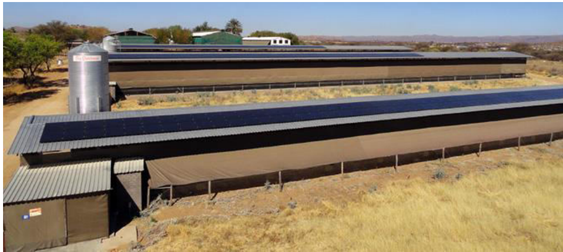
Figure 1: Solar modules on several chicken coops at Waldschmidt Eggs