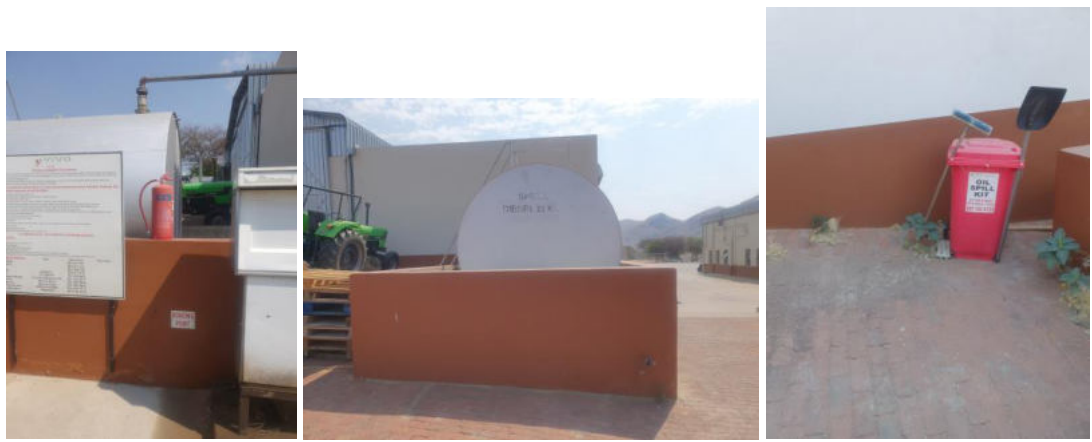
Figure 3: Installations on site

A number of potential environmental impacts may occur during the operations at the site and possibly during the decommissioning phase of the installations. There are already existing environmental controls on site (See Figure 3 below), hence some of the recommendations are already being implemented on site and emphasis should be given to continuous and preventative maintenance of the systems on site. The following guidelines must be used: