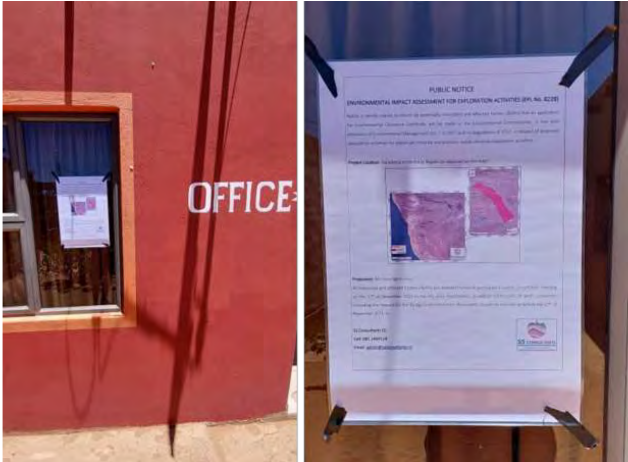
Site notices at the home affairs office in Karasburg