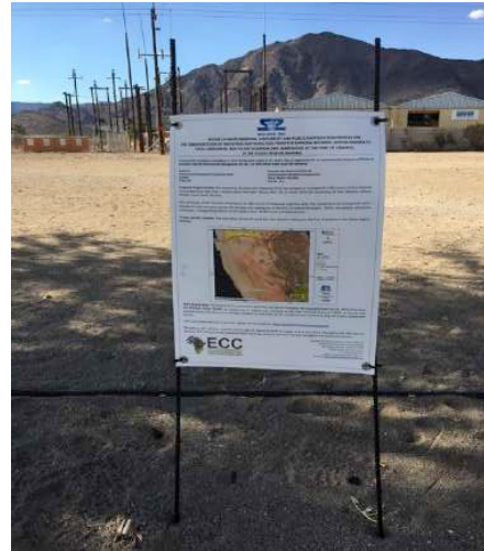
Near by the Engine service station in Rosh Pinah