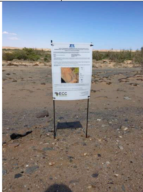
Near by the boarder post in Oranjemund