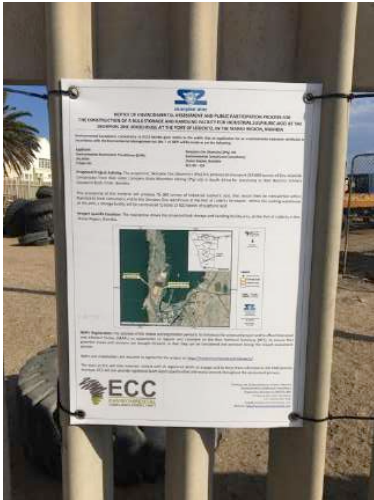
Boundaries of the Port of Lüderitz