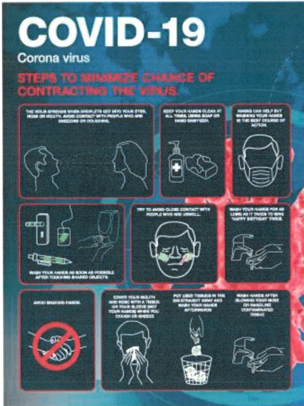
Figure 1: Typical COVID-19 information poster to be placed at designated areas at the mining sites.