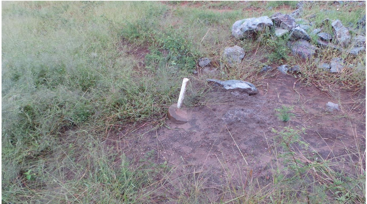
Figure 1 RC drill hole are after rehabilitation (Photo for illustration purpose)

During exploration, evasive processes includes trenching and drilling. Trenching is normally done by hand, they are not deep and they are immediately rehabilitated after sampling. Drilling may necessitate the establishment of access roads to targets site, hence these must be rehabilitated immediately. After geochemical sampling with the drill, the casing must be removed and the drill hole must be properly covered, unless otherwise agreed with the farmers to leave the casing for purpose of making water borehole (Figure 1).