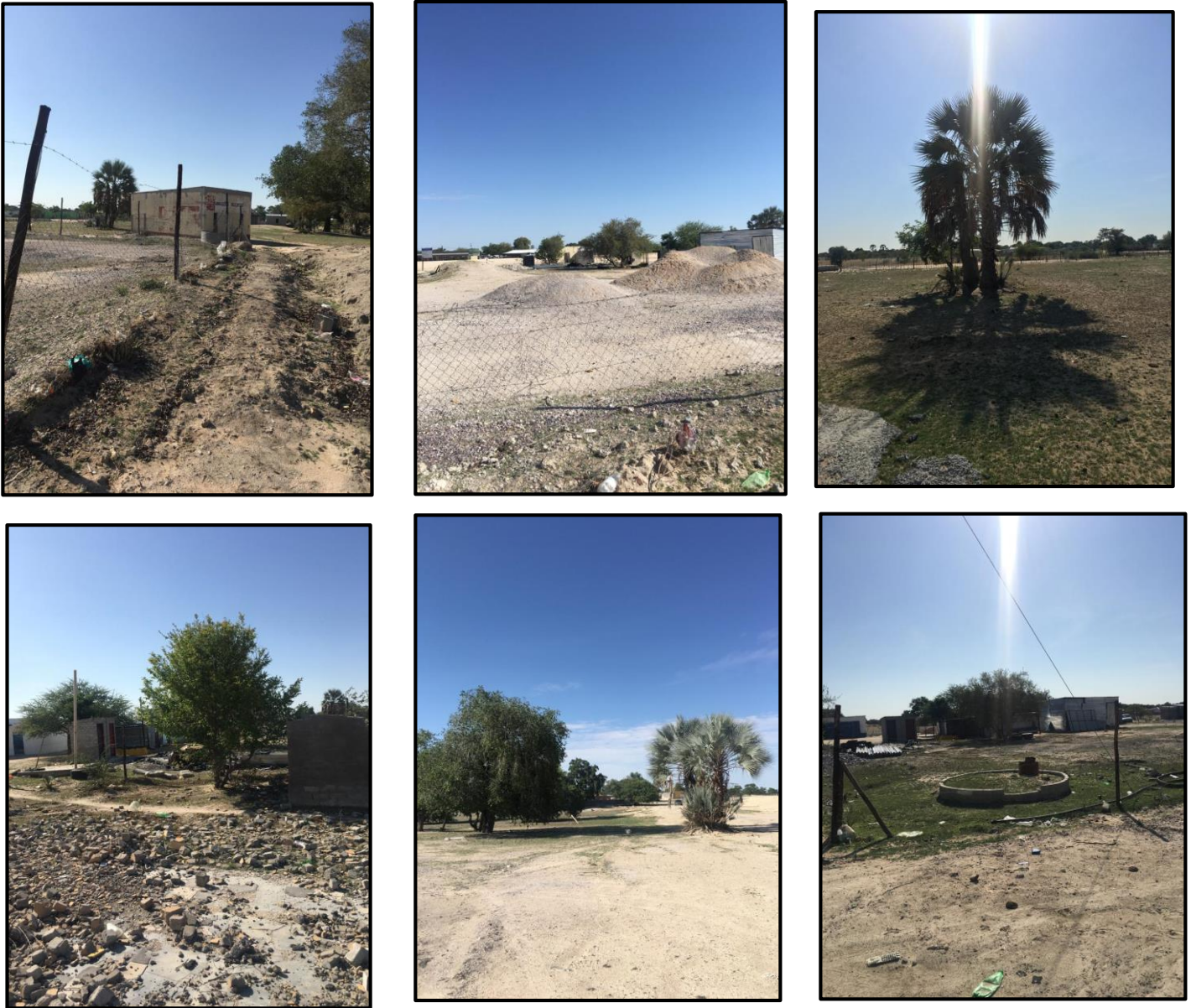
Figure 2: Current project environment

The current state of the project site best reflects the nature of human impact on the environment, the project area has been previously developed and is often used as a solid waste dumping site by nearby residents, and the regional council will have to commission a scrapper periodically to clear off the waste.