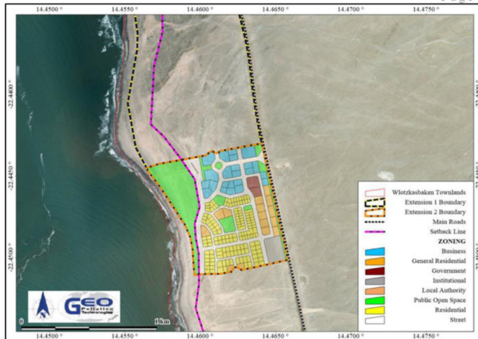
Figure 4-2 Proposed Wlotzkasbaken Extension 2