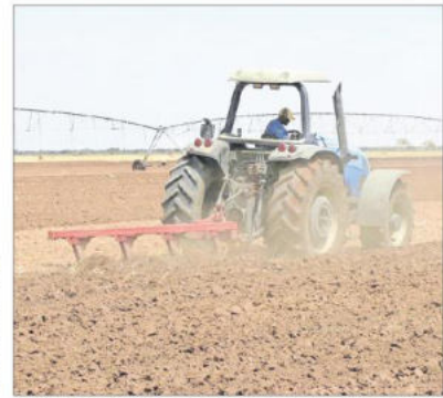
Agribank sê hy sal nie spesiale behandeling gee aan boere onder die Regstellende Aksie-leningskema (AALS) wat versuim om hul lenings terug te betaal nie.

Nog 'n boer het gesê Agribank het 'n finansiële gat gegrawe