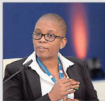
Die minister van justisie, Yvonne Dausab, vra vir hervorming.

Dausab het ook kommer uitgespreek oor die etiese optrede van agente wat deur die meeste se kantoor aangestel is, aangesien meer en meer gevalle van oneerlikheid, wanhantering van boedelbates en algemene