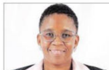
Justizministerin Yvonne Dausab

Die Umsetzung dieser Gesetze wurde nach Prioritäten geordnet und