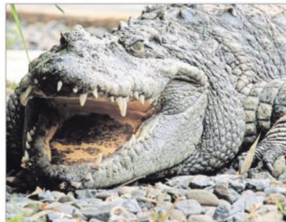
DANGEROUS: The environment ministry aims to implement practical and innovative preventative measures against crocodile attacks.