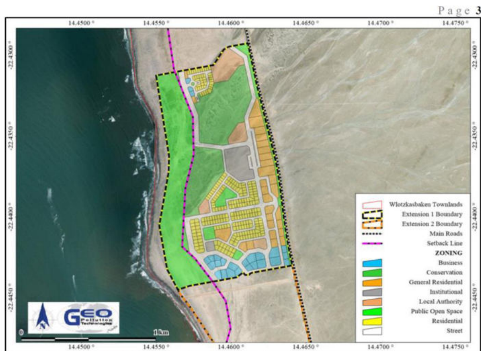
Figure 4-1 Proposed Wlotzkasbaken Extension 1

Most services associated with the township development will be provided by the Proponent. These include water supply, sanitation, waste removal, road and related infrastructure maintenance, public open space management, etc. Some of these services will require the establishment of large infrastructure components such as bulk water supply lines and effluent treatment plants. Such infrastructure components will for the most part be located outside of the proposed township footprint and will be subject to separate environmental assessments, which will have to consider component specific aspects in relation to its ultimate location or route. All things remaining equal, such services will be provided as follows: