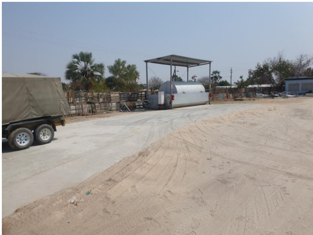
Figure 1: Above Ground Engen Diesel tank

The existing Engen installations have a valid Consumer License approved by the Ministry of Mines and Energy. The site operations and installations are in accordance with Engen Namibia (Pty) Ltd policies and regulations. The diesel is stored in a 14 m 3 above ground tank see Figure 1 below.