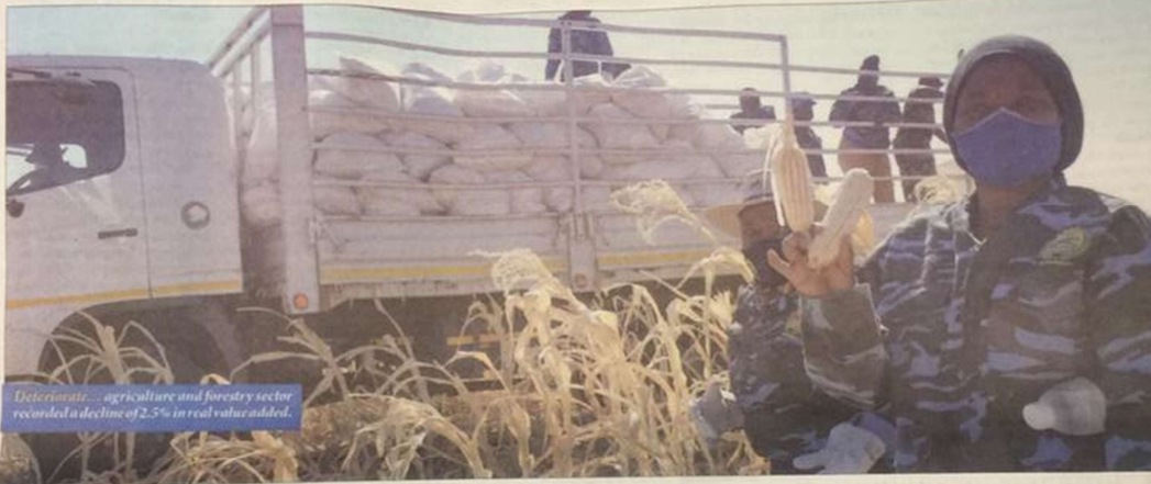
Deteriorate... agriculture and forestry sector recorded a decline of 2.5% in real value added.