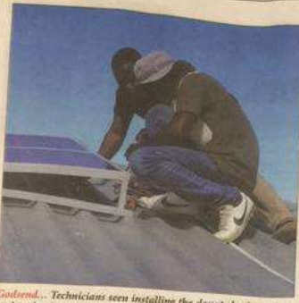
Godsend... Technicians seen installing the donated solar system at the school