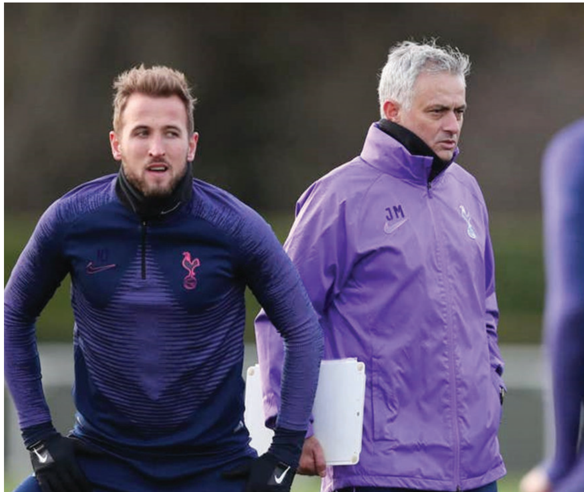
Mourinho arrives at Tottenham facing some significant challenges, inheriting a squad enduring their worst Premier League start in more than a decade and already 11 points off the top four.

When Spurs have fired on all cylinders under Pochettino, Dele Alli and Christian Eriksen have generally been at the heart of it, but both have struggled for form over a prolonged