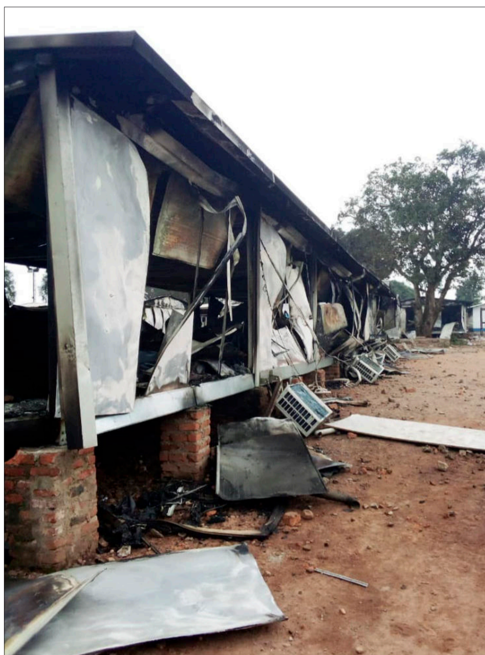
Standoff... Burnt containers are seen at the United Nations (UN) civil base in Beni in the eastern part of the DR Congo.

B ENI - Nineteen people were killed Wednesday in eastern DR Congo by a suspected group blamed for massacres that have sparked deadly protests against the United Nations' peacekeeping mission, the UN said.