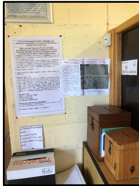
Figure 3: Site Notices on the project development were posted on site and at Town Council notice board