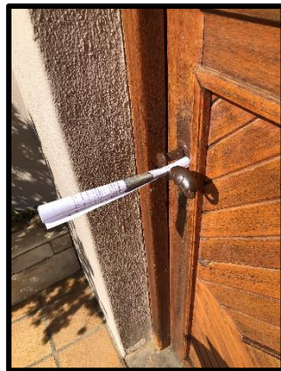
Figure 4: local neighbour's consultation

N.B: The consultant took initiative by consulting all neighbours close to the site. Were there were no people a questionnaire and BID was left in post box. No objections were raised by I&AP in relation to the project. Community members and Luderitz Town council administration were all involved.