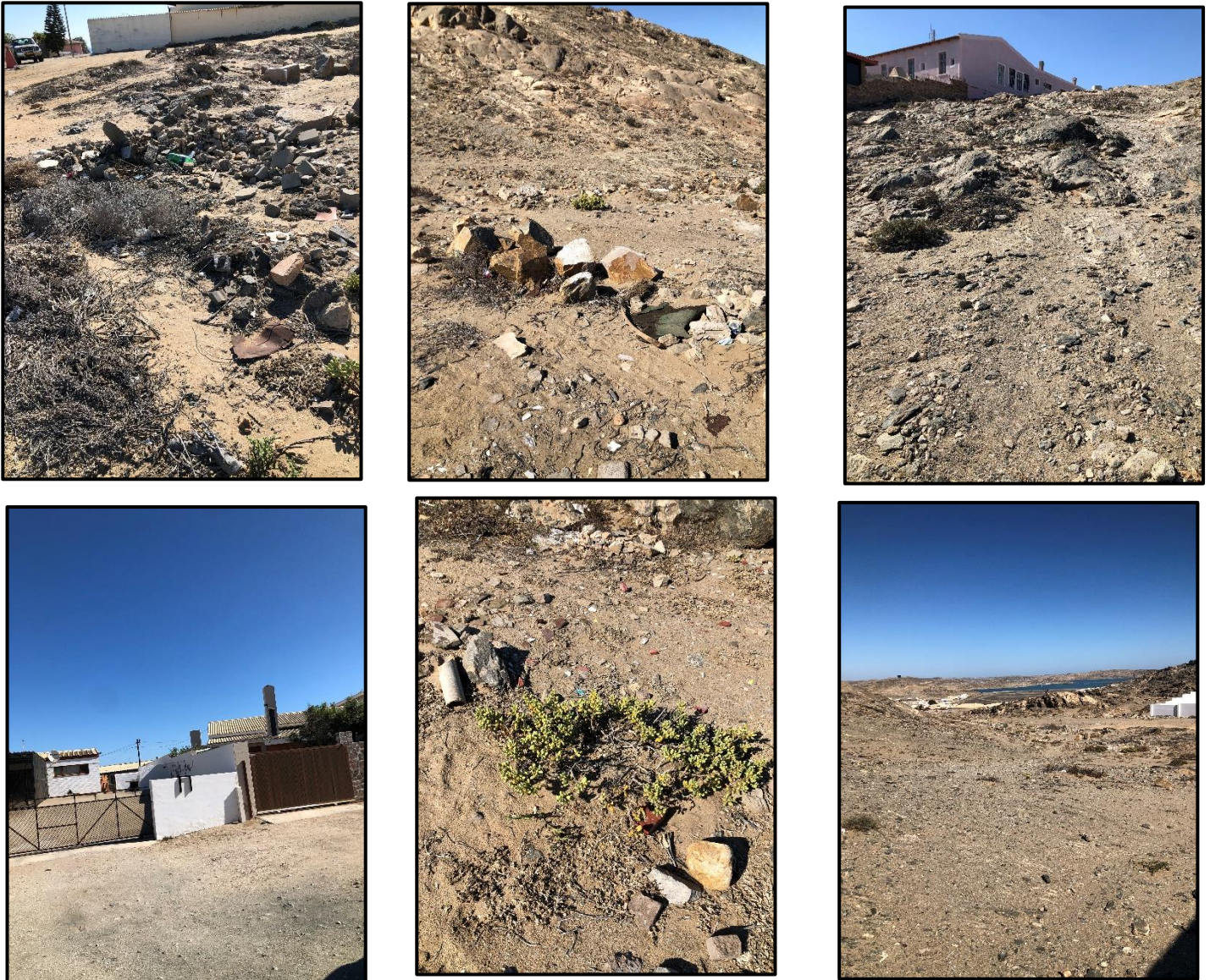
Figure 2: Portion 95 current state

The site is approximately 8km from the coastal shoreline and the project does not threaten or interfere with coastal environs in any way.