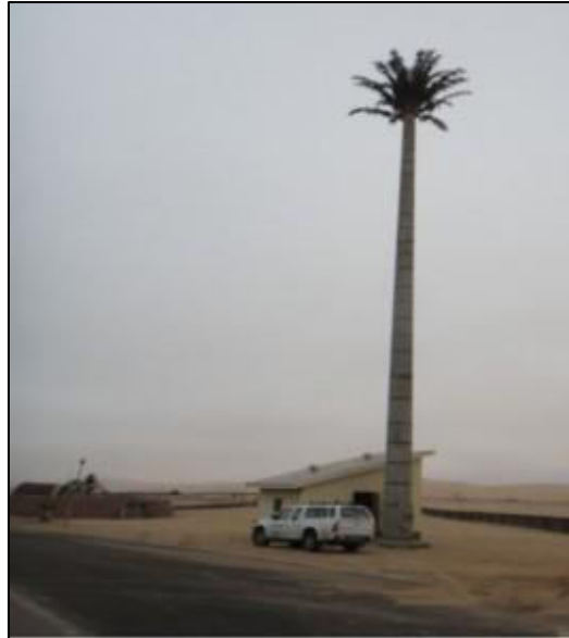
Figure 2-1: Example of the proposed tower

( https://www.powercom.na/index.php/portfolio-details/item/2-lattice#portfolio-wrapper )