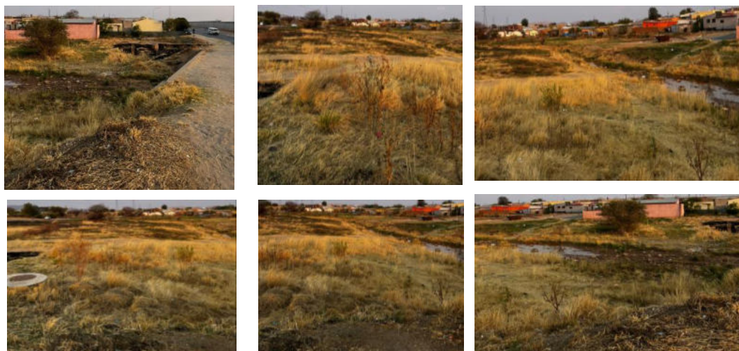
Figure 5-2: Vegetation commonly located within the subject area.

According to Lawrence (1971), the vegetation of the region is classified as highland savanna and comprises several Acacia species and numerous species of perennial thorn trees in the valleys and shrubs and grass on the steep slopes. Figure 5-2 below depicts the trees commonly found within the subject area.