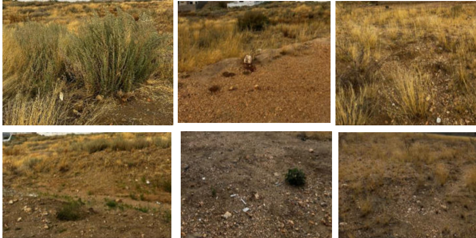
Figure 5-2: Vegetation commonly located within the subject area

According to Lawrence (1971), the vegetation of the region is classified as highland savanna and comprises several Acacia species and numerous species of perennial thorn trees in the valleys and shrubs and grass on the steep slopes. Figure 5-2 below depicts the trees commonly found within the subject area.