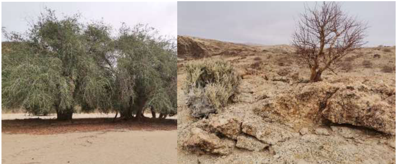
Figure 4: Dominant vegetation type for the farm area

The vegetation of the farm area is characterized by the mountain savanna and riparian zone along the river streams. The vegetation is dominated by a combination of flora such as Acacia erioloba (Kameeldoring), Anna tree, Commiphora sp, Boscia foetida . The farm is home to an abundance of wildlife such as ostriches, impala, kudu, springbok, zebra.