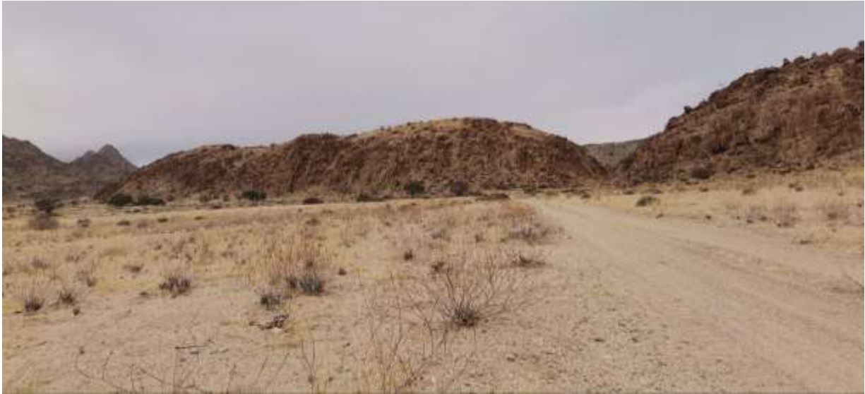
Figure 3: Scenic view of Farm Namib Fontein 91

The farm area falls under the arid climate of southern Africa's summer-rainfall region. This region is characterized by low rainfall, extreme temperature ranges, and unique climatic factors influencing the natural environment and biodiversity. The farm landscape is made up mainly of mountain ranges, flat areas, and streams connected to the Khan River.