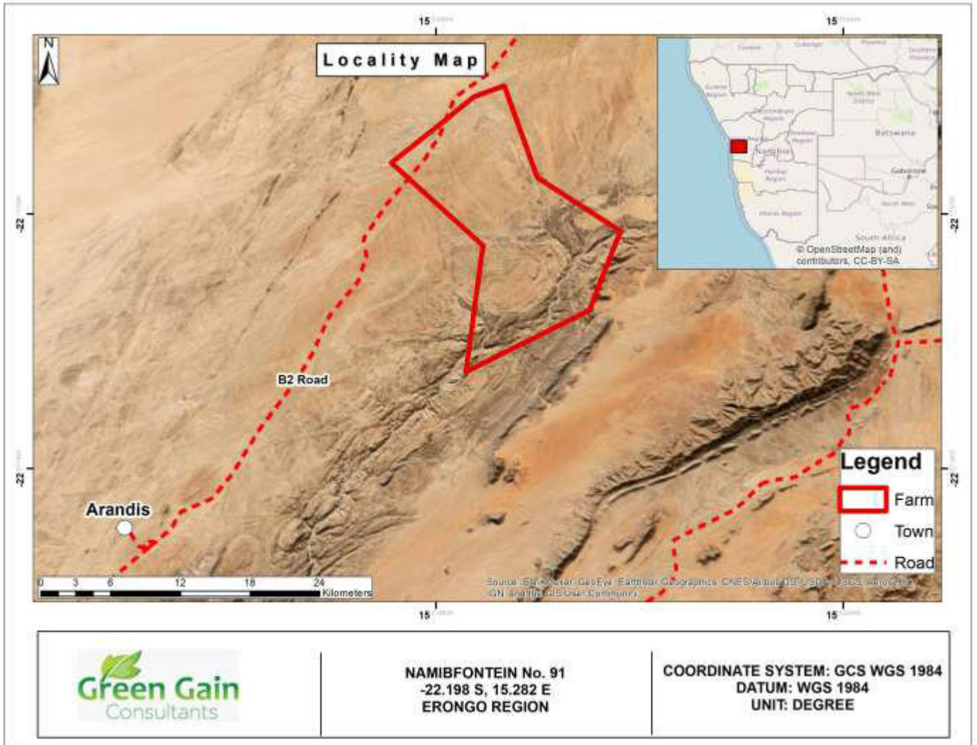
Figure 1: Locality map of Farm Namib Fontein 91

Farm Namib Fontein 91 measures approximately 9700 ha in extent and is located between Usakos, and Arandis in Karibib District of Erongo region.