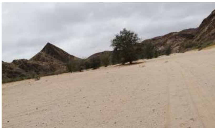
Figure 2: Vegetation of the area

The farm area falls under the arid climate and falls into southern Africa's summer-rainfall region. This region is characterized by low rainfall, extreme temperature ranges, and unique climatic factors influencing the natural environment and biodiversity. The farm landscape is made up mainly of mountain ranges, flat areas, and streams connected to the Khan River. The main vegetation of the exploration area is characterized by the mountain savanna and riparian zone along the river streams. The vegetation is dominated by a combination of flora such as Acacia erioloba (Kameeldoring), Anna tree , Commiphora sp , Boscia foetida . The farm is home to an abundance of wildlife such as ostriches , impala , kudus , springbok , zebra .