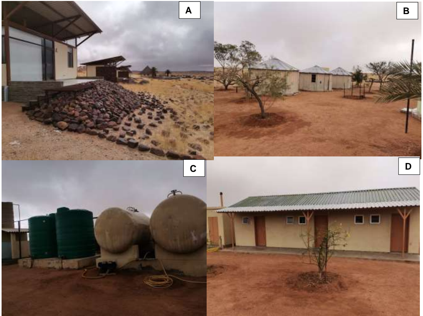
Figure 3: Existing farm infrastructure

Currently, Farm Namib Fontein 91 is operated exclusively as a private game farm. There is a private campsite with 5 luxury suites (A) which can accommodate 10 people. There is also workers' accommodation (B) and a small site office (D). Water is sourced from boreholes and stored in above tanks (C) while energy is sourced from an overhead powerline connected to a 3-phase transformer.