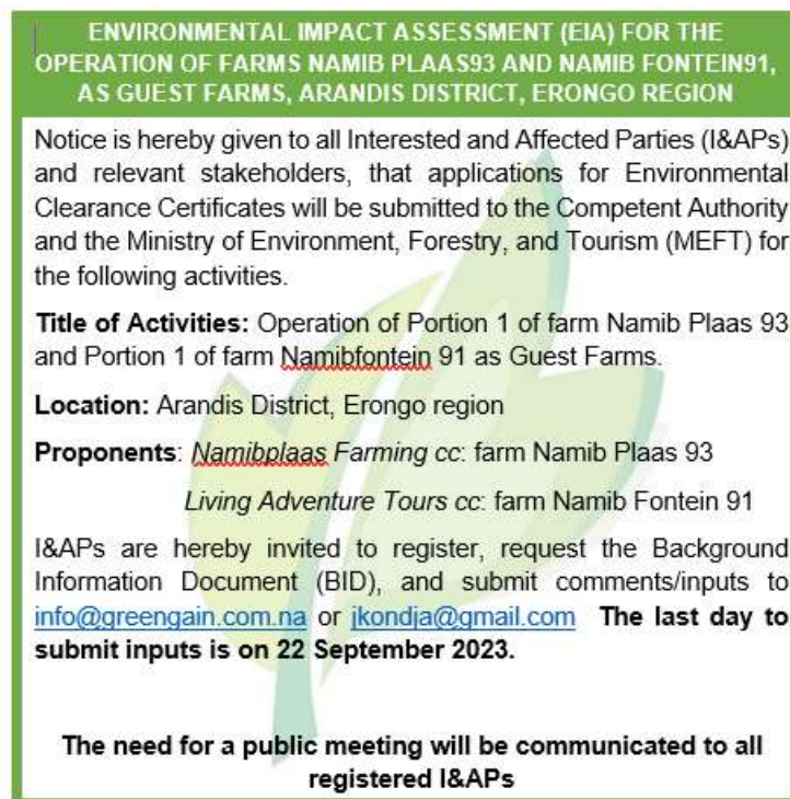
Figure 5: Copy of the Public Notice

The public were notified through Newspaper adverts (4 x Newspaper adverts), and Public Notices were placed at the Farm gate and in the nearest towns (Swakopmund and Uusakos).