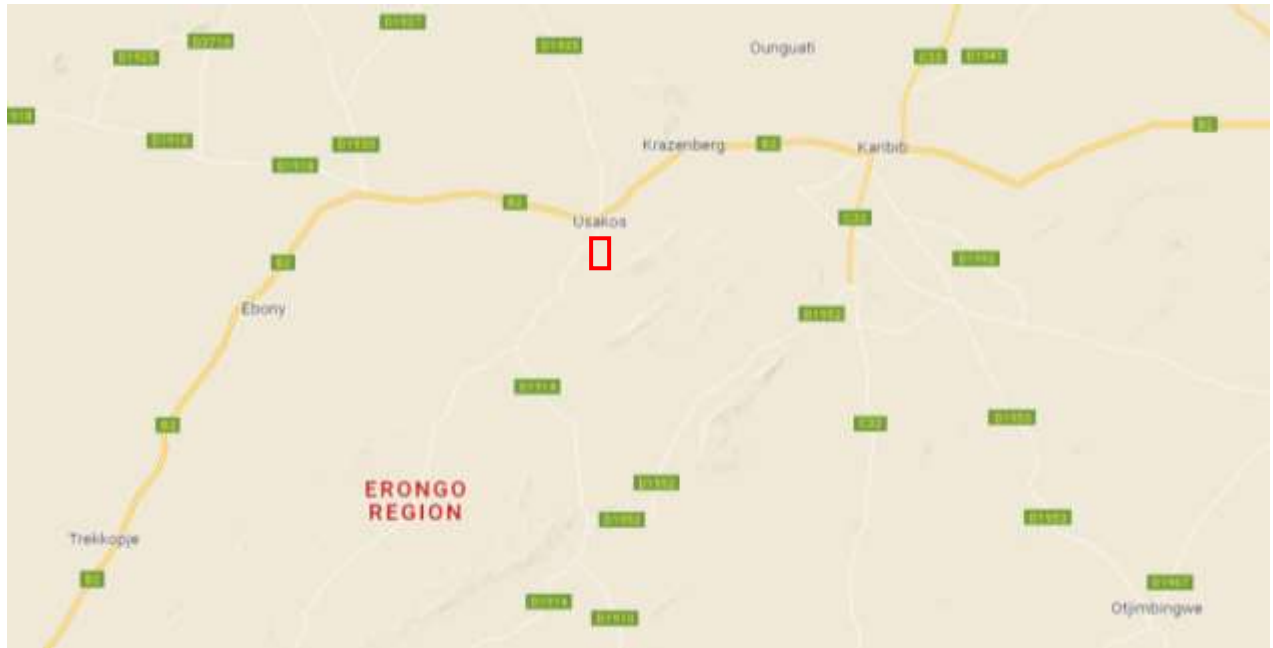
Figure 1: Locality of the map

Farm Namib Fontein 91 measures approximately 9700ha in extent and is located about 40km southeast of Arandis in the Erongo region.