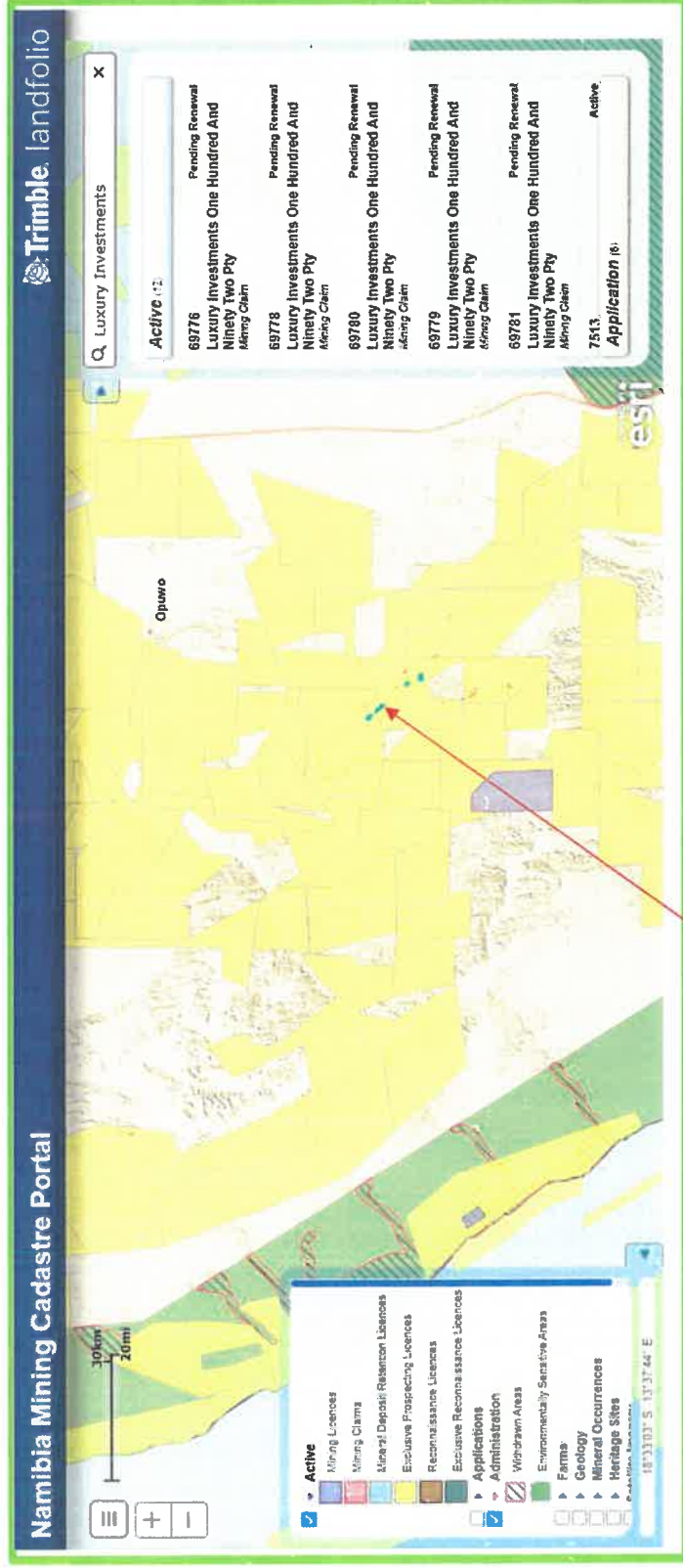
Figure 2: Location of the 6 mining claims; 69776 – 69781, situated at Otwani, Opuwo Rural Constituency, Kunene Region, Namibia (MME Portal, 2020).