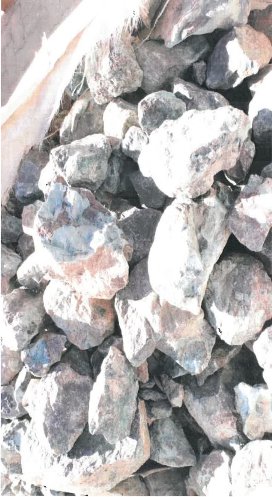
Copper ore ready for processing- crushing, washing, drying and packaging