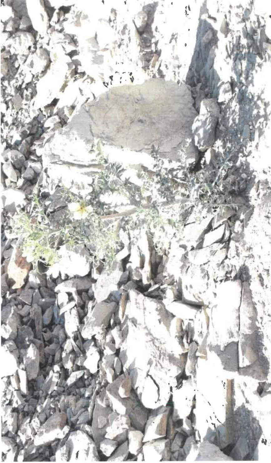
Argemone mexicana – alien plant recorded in the mining area to be removed