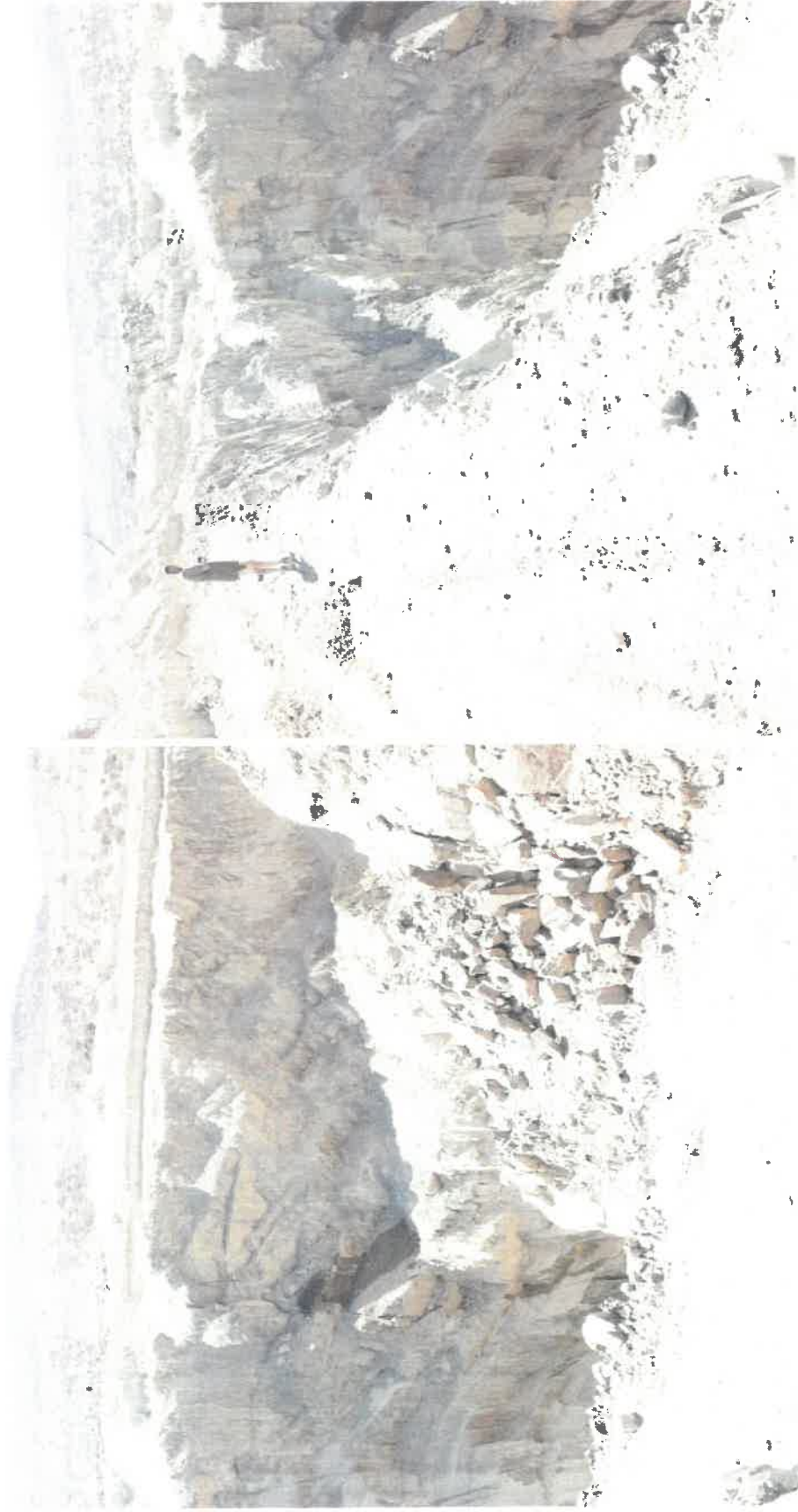
Luxury Investments One Hundred And Ninety Two Pty (Active Mine - Pit)