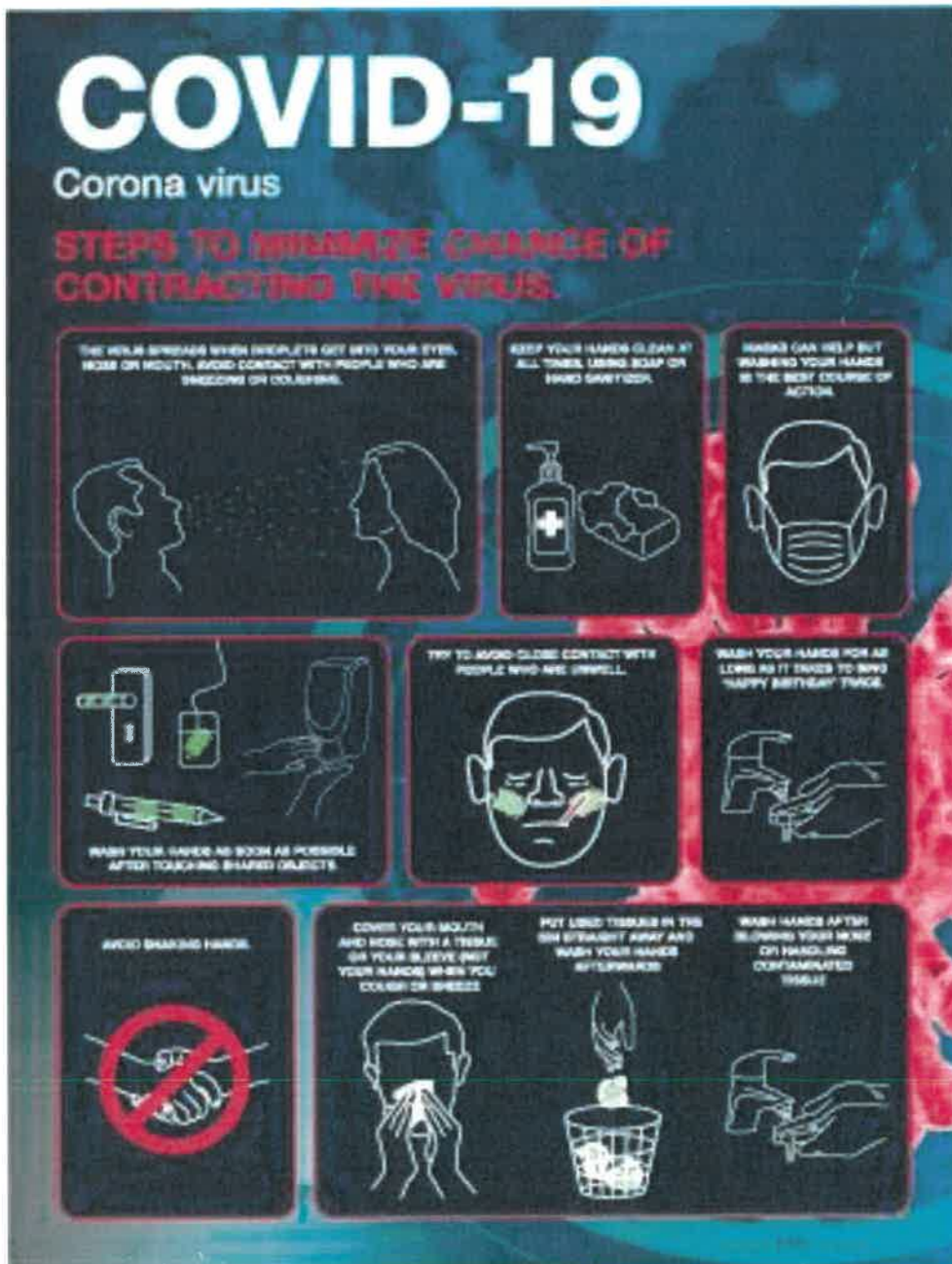
Figure 1: Typical COVID-19 information poster to be placed at designated areas at the mining sites.